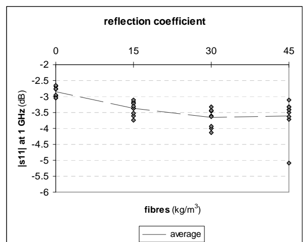
Fig. 5. Reflection coefficient moduli at 1 GHz of the single and averaged measurements of different fibre content dosages.

Fig. 5 shows the reflection coefficient moduli only at 1 GHz. Although reflection coefficient is function of fibre dosage, a saturation effect appears at relative low dosage (45 kg/m 3 ). One additional characteristic shown in Fig. 5 is the slightly positive correlation between dispersion of measurements and fibre dosage. It is easy to figure out that as fibre density increases, sensor may detect or not a single fibre nearby. Then, it increases its dispersion. This Fig. 5 also demonstrates that in medium of high dosage fibre content, spatial averaging is necessary in order to obtain representative data.