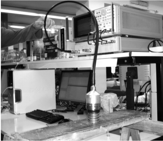
Fig. 2. Experimental setup.

sample. Complete setup with sensor, sample and VNA is showed in Fig 2.