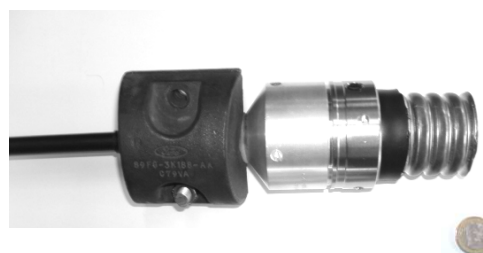
Fig. 1. OECTL Sensor.

The sensor was made using a CELLFLEX LCF 158-50 JA cable, provided by the company RFS. It was cut using a saw, filed and assembled to its N-connector. A 1,4 kg load was put over the sensor in order to normalize the force between the sensor and the sample. A conductive mesh was soldered to the edges of the sensor to make a smooth transition and ensure total contact with the sample.