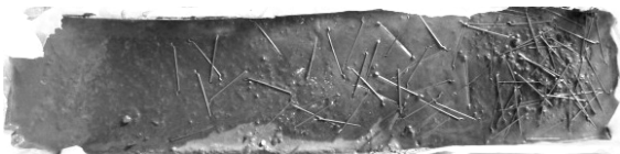
Fig. 3. 600x150x20 mm sample containing each 15x15 cm area different fibre dosages.

All the tests were performed on a 600×150×20 mm mortar slice. The sample were produced using Ordinary Portland Cement and calcareous sand, passed through a 5 mm sieve, with a sand/cement ratio of 3,0 and a water/cement ratio of 0,50. No additives were used. Sample preparation included a first pouring of 10 mm of mortar on a box. The fibres were randomly placed in four areas of 150x150 mm, containing 0, 15, 30 and 45 kg/m 3 of fibres successively as seen in Fig 3. After pouring the fibres, a final 1 cm thick of fresh mortar was placed on. After curing, the sample was placed over two wooden stands, in order to avoid interferences due to metallic objects.