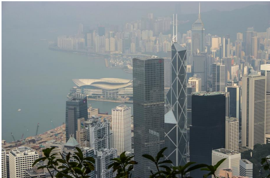
Figure 1. Hong Kong. Bank of China among other tall buildings

A well-known tall building, which differs in shape from other tall buildings in its vicinity, is the Bank of China in Hong Kong (1990) (Figure 1). The building is designed on a square plan, but the higher parts form triangular segments of different heights. The shape looks as if it was constructed from many triangular pyramids. It can be also said that the building “looks like a three dimensional tangram toy” (Lepik, 2008, p. 110). After the completion of the Bank of China, other buildings of similar height and three higher buildings were built in Hong Kong: Central Plaza, Two International Finance Centre and International Commerce Centre. However the following view remains valid: “Due to its height and unusual shape, the Bank of China is one of the most memorable skyscrapers in Hong Kong.” (Ali & Armstrong, 1995, p. 297)