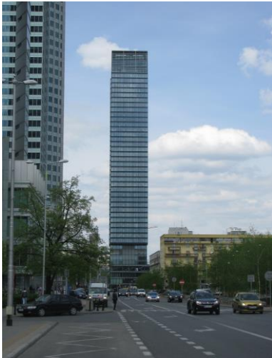
Figure 3. Warsaw. Cosmopolitan