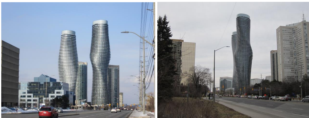
Figure 5. Mississauga. Absolute World Towers

1976) and Evans et al. (1982), we can conclude that other factors also affect the memorisation of the building and its imageability: the towers located at one of the main intersections in the city centre, are higher than the other buildings, and have a very modern architecture. Absolute World Towers are visible from many locations and from various distances. Thus, they meet the visibility dimensions. Due to their distinctive height and shape, the towers are also an important and recognisable element of the silhouette of the city, which, prior to their completion, was not distinguished by anything in particular. Initially, the project envisaged building a single tower in Mississauga ( The Global Tall Building Database of the CTBUH ). The visual effect would then be weaker than in the case of the two very similar towers. However, one can assume that due to the unique shape, one tower would also be very imageable and easy to remember.