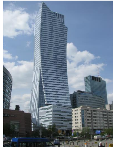
Figure 4. Warsaw. Złota 44