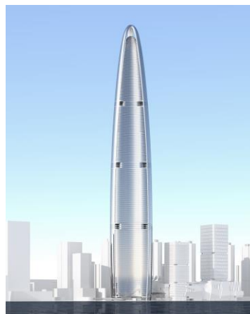
Figure 7. Wuhan. Wuhan Greenland Center