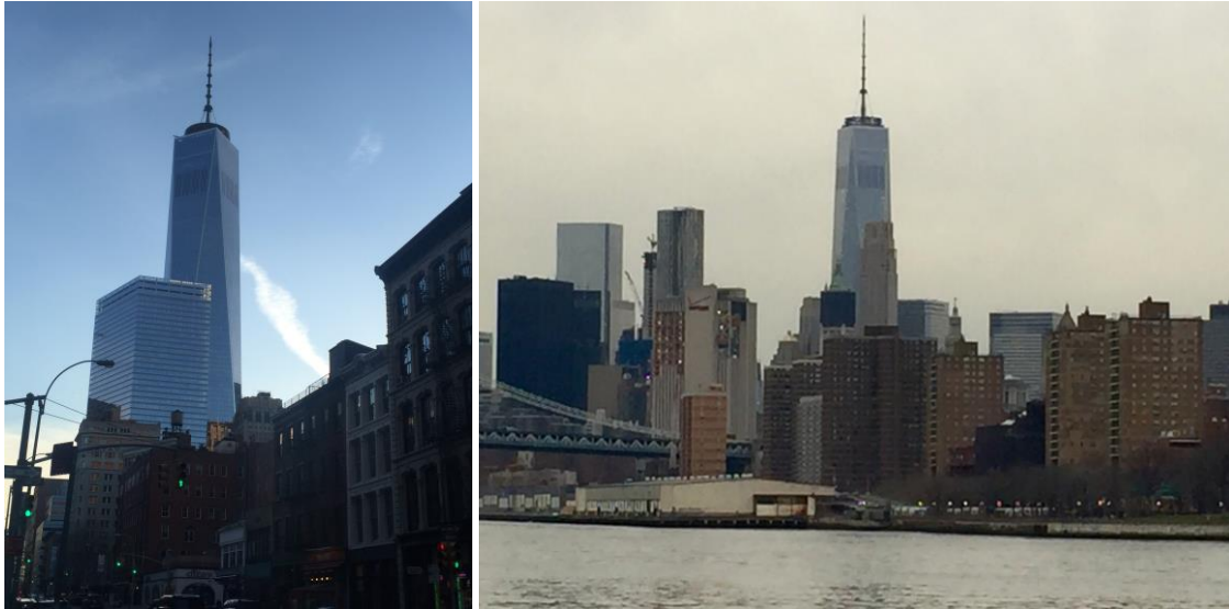
Figure 8. New York. One World Trade Center

In recent years, next to the place where the destroyed World Trade towers stood, One World Trade Center has been built (Figure 8). Currently, it is the tallest building in New York. Its shape may resemble a rectangular with bevelled edges along its entire height.