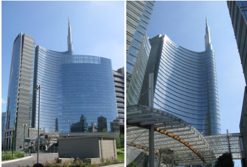
Figure 6. Milan. Porta Nuova Garibaldi

element. Although the visibility of this object is limited to certain areas of the city, it provides an interesting terminus for the perspectives of some streets in Milan.