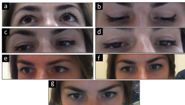
FIGURE 1. Screen capture of the video recordings obtained from the same participant in each of the seven experimental configurations. (a) Silent observation of a landscape picture at 2 m. (b) text (book position). (c) Tablet. (d) Text aloud (book position). (e) Text pasted over display. (f) PC330. (g) PC100.

A real-time analysis of the video captures was conducted by two external independent examiners, unaware of the reading conditions associated to each video, although complete masking was not possible as line of gaze and convergence were markers of observation distance. Complete blinks were counted when none of the cornea was visible on blink