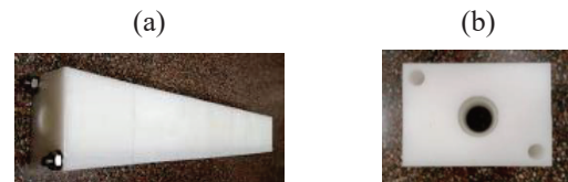
Fig. 2. 7 \times 10 \times 70 \text{ cm}^3 HDPE blocks with a 1-inch central hole where the neutron counters are embedded (a). The blocks consist of seven 7 \times 10 \times 10 \text{ cm}^3 smaller pieces (b) which are assembled using two stainless steel rods as shown in (a).

The HDPE moderator matrix can be divided in two parts: the “core”, which is shown in blue in Figure 3, and the “reflectors”, which are shown in red. The main objective of the “core” is to moderate neutrons while the primary objective of the 4 cm thickness “reflectors” is to back-scatter high-energy neutrons in order to increase the detection efficiency. The dimensions of the moderator are 58 \times 43 \times 70 \text{ cm}^3 in configurations 10A and 12, while in miniBELEN-10B are 50 \times 49 \times 70 \text{ cm}^3 .