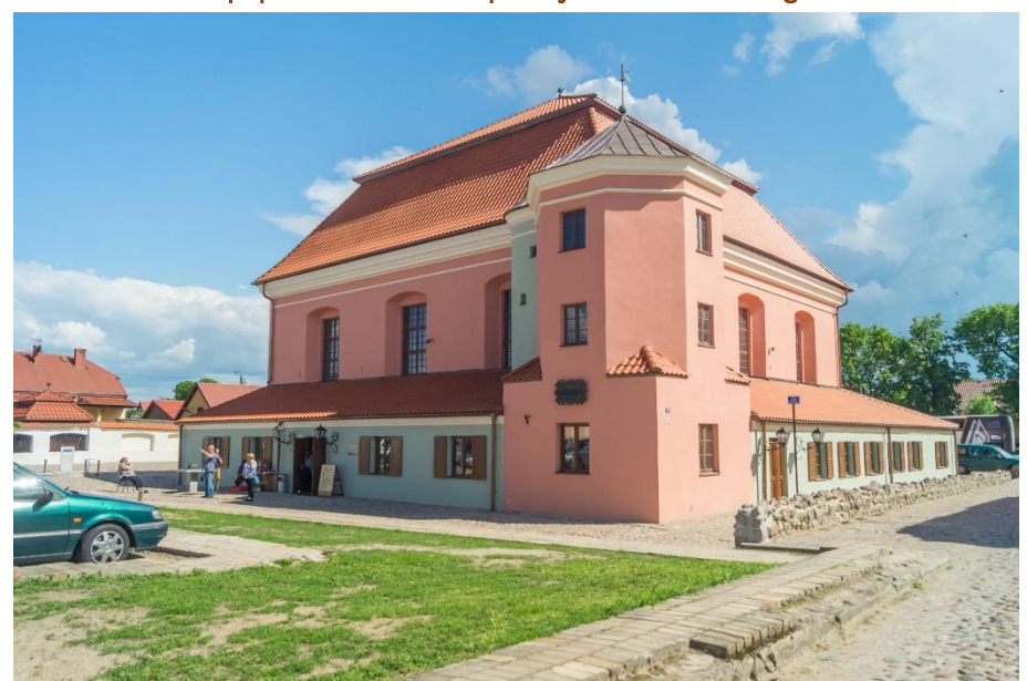
Figure 12. Former Synagogue, now the Museum of Jewish Culture in Tykocin, a Polish town with one of the oldest Jewish populations but completely eradicated during the Holocaust in 1941

The first case in the Polish region of Podlasie is the Jewish Museum and Synagogue in the small town of Tykocin, ca. 25km away from the regional capital, Białystok. Tykocin's most famous monument is the 17<sup>th</sup> century Great Synagogue and the Talmudic House from the 18<sup>th</sup> century (Figure 12). This synagogue has rich Renaissance decorations, it is the second largest and second oldest in Poland. The Jewish Museum and restored Synagogue in Tykocin represents an outstanding public active type of local heritage institution. The museum organises temporary exhibitions and staged observation of Jewish holidays, as well as concerts. The curators are not Jewish, they are mainly academics from Białystok, as there is no longer a Jewish community in Tykocin. Nevertheless, the town's Jewish heritage has become a "place of pilgrimage" for the Jewish youth and many tourists from Poland, the United States, Israel, and other countries from around the world. School trips and organised groups are usually scheduled all day in the season between April-October. The traces of Jewish culture are omnipresent even in the public space of the town, where there is the traditional Jewish restaurant Tejsza.