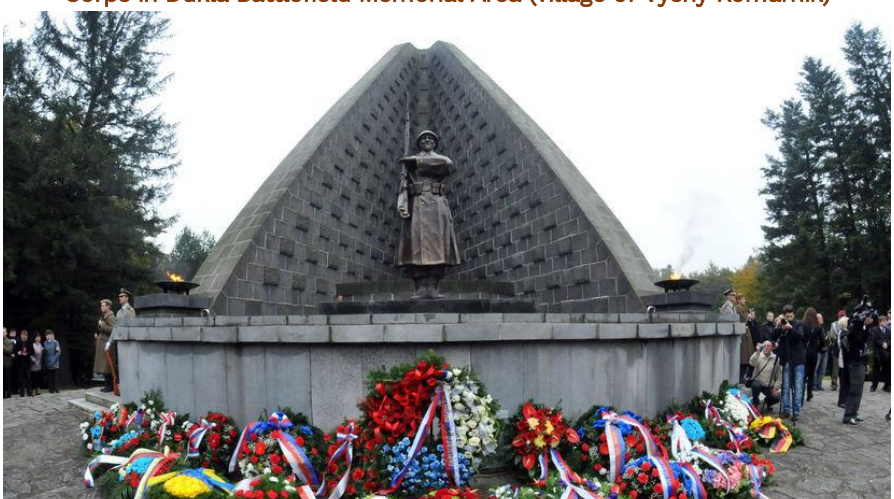
Figure 11. Annual commemorations at the Memorial of Czechoslovak Army Corps in Dukla Battlefield Memorial Area (village of Vyšný Komárník)