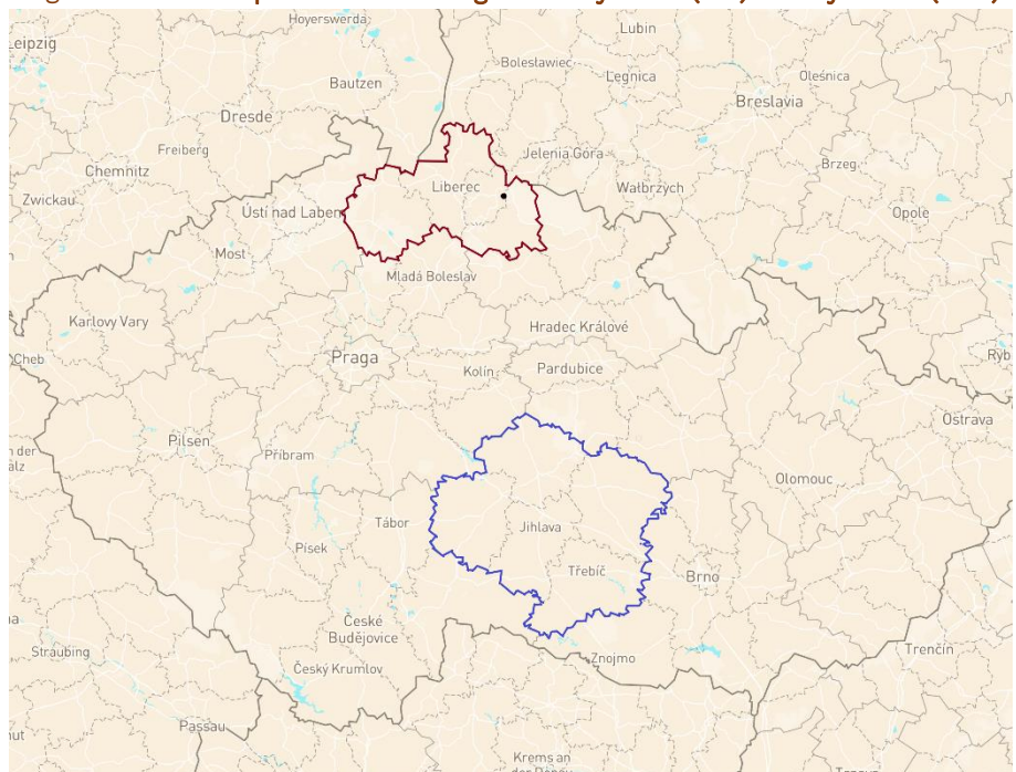
Figure 5. Czech Republic and the Regions of Vysocko (red) and Vysočina (blue)

The Central European small towns and regions discussed here are in peripheral areas of Czech Republic (CZ), Slovakia (SK) and Poland (PL), which allows us to consider different responses to heritagization. In this examination, we may articulate the core questions as the following: How do (can) small town communities mobilize heritage to foster local identities and make themselves sustainable/resilient? Who are the actors? What are the strategies?