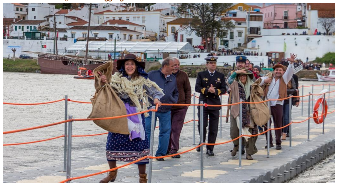
Figure 4. Smuggling Festival in Alcoutim and Sanlúcar de Guadiana

While local communities may share cultural features or identities, transboundary initiatives focused on cultural aspects may encounter constraints that deserve highlighting. Despite the launching of pan-continental and regional cooperation strategies within the EU and, on a lesser scale, the Euroregions (in our case, Alentejo-Algarve-Andaluzia), or bilateral (between countries), the most effective and common way for improving collaborations in borderlands is inter-local cooperation (for further details, see Timothy & Teye, 2004) as they are not as dependent on central governments and face "fewer bureaucratic obstacles" ( ibid. , p. 588), which is clearly beneficial to promoting tourism and "[...] contributes to reduce the separative role of the boundary [because] the common problems in a peripheral region prevail over nationalistic considerations" (Leimgruber, quoted in Timothy & Teye 2004). However, heritage policies differ between national and/or municipal governments, which means that cultural routes are integrated into different legal realms depending on the specific location of heritage assets.