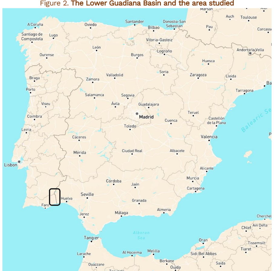
Figure 2. The Lower Guadiana Basin and the area studied