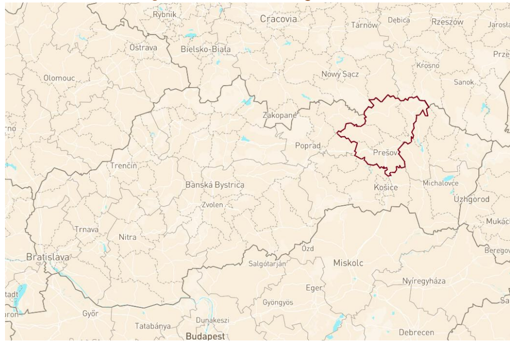
Figure 6. Slovakia and the Region of Šariš