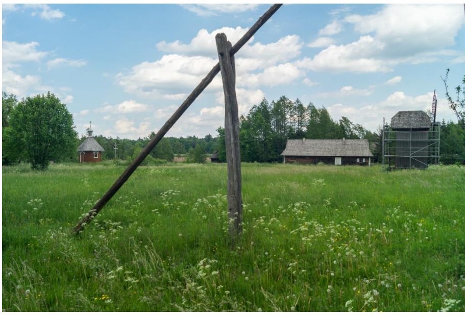
Figure 13. The Open-air Museum in Białowieźa collects and preserves wooden vernacular architecture of the Ruthenian culture in Podlasie region