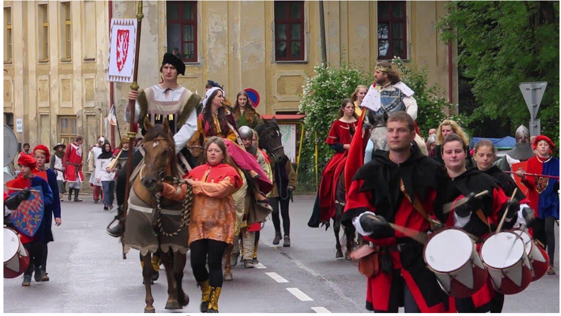
Figure 8. The Barchan Festival parade depicting the King entering the town of Jemnice