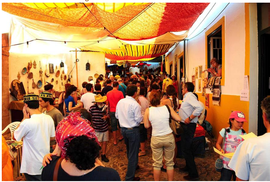
Figure 3. Mértola's Islamic Festival

It should be noted that this initiative was able to counter the depopulation trend in the Mértola municipality through creating jobs for local individuals and the infrastructures for attracting visitors into the urban centre, as well as training and knowledge transfer programs (Del Espino, 2020). Cultural tourism thus emerges as key to sustainable development and proves that heritage can support resilience or, in other words, that awareness of the past can constitute a powerful tool for a brighter future and an inspiration for projects that intend to promote the participation of local communities as well as for proposing Mértola for World Heritage status.