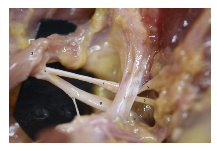
Figure 1. Anatomical variation on left shoulder from specimen C: different anatomical structures could be observed as follows: (1) superior transverse scapular ligament; (2) inferior belly of omohyoid muscle; (3) suprascapular nerve; (4) acromioclavicular sensitive branch; (5) supraspinatus motor branch; (6) infraspinatus motor branch; note that the division into supraspinatus and infraspinatus motor branches is proximal to superior transverse scapular ligament.

In four of the six subjects, the SNe was divided into two motor branches after crossing STSL, but specimens C (Figure 1) and F (Figure 2) presented an AV: the SNe divided into two motor branches proximal to the STSL. In both cases, the medial branch reached the supraspinatus muscle, and the lateral branch continued underneath the inferior transverse scapular ligament to reach the infraspinatus muscle by three to five motor branches.