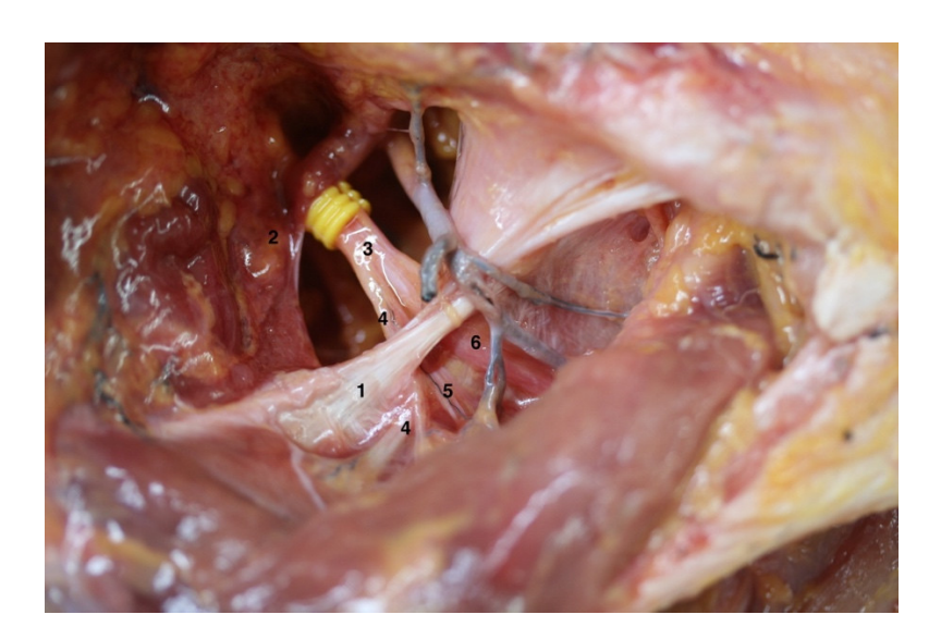
Figure 2. Anatomical variation on the right shoulder from specimen F: the different anatomical structures could be observed as follows: (1) Superior transverse scapular ligament; (2) Inferior belly of the omohyoid muscle; (3) Suprascapular nerve; (4) Acromioclavicular sensitive branch; (5) Supraspinatus motor branch; (6) Infraspinatus motor branch; note that the division into the supraspinatus and infraspinatus motor branches is proximal to superior transverse scapular ligament.