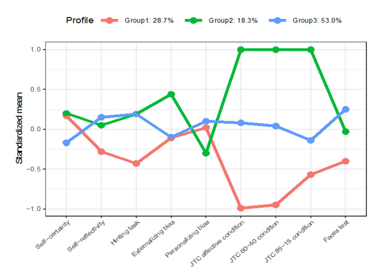
Fig. 1 Profiles of each group in the male sample with standardized means in each of the variables included in the LPA. Group 1 refers to the JTC profile. Group 2 refers to the Indecisive profile. Group 3 refers to the Homogeneous profile