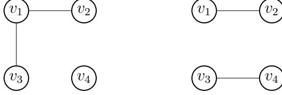
Figure 2: Two chromatically equivalent graphs, X_1 (left) and X_2 (right).

We say that two graphs G and H are chromatically equivalent if they have the same number of n -colorings, for every n \geq 1 . This is equivalent to saying that G and H have the same chromatic polynomial. The two graphs X_1, X_2 in Example 2 are chromatically equivalent, a fact that will be used in what follows. Furthermore, all trees with the same number of vertices are pairwise chromatically equivalent, because if T is a tree with n vertices, then \chi(T, x) = x(x-1)^{n-1} .