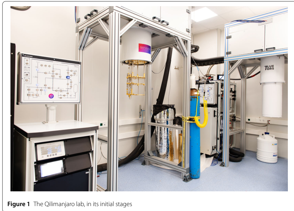
Figure 1 The Qilimanjaro lab, in its initial stages

Over the last decade, many experimental groups have contributed to prove the feasibility of implementing quantum computation using superconducting circuits: Coherence improvements were shown possible [17], several advanced control techniques have been developed [11, 18, 21], while both small- and medium-size algorithms have been implemented [2, 9]. Prototypes already exist that contain these many building blocks, with full availability on the cloud. 14,15 However, such building blocks are not only restricted to gate-based quantum computers. Qilimanjaro aims at leveraging these many improvements into its coherent quantum annealers, overcoming both coherence and circuit complexity problems of existing annealing platforms.