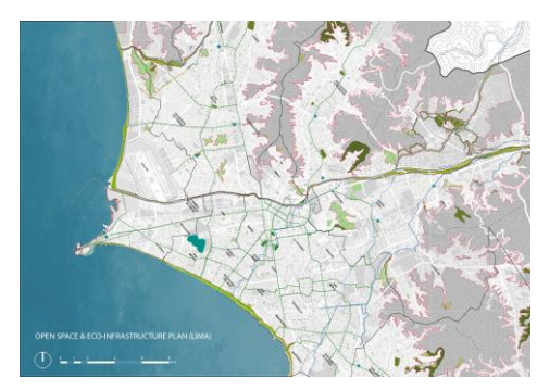
Figure 3-4: Integrated Transport System (SIT) of Lima & Lima's Open Space and Ecological Infrastructure System