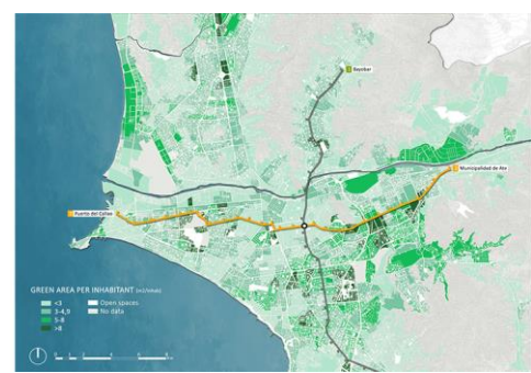
Figures 7-8: Urban density (inhabitants/km2) and green area (in m²) per inhabitant in Lima Metropolitana.