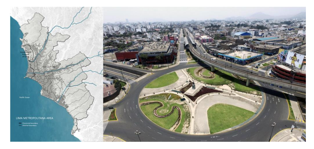
Figures 1-2 Lima Metropolitana, physical context and Higuereta roundabout view.

and on the other hand, the densification of urban areas using high-rise residential buildings, with overcrowding rates reaching 52% -in the case of Gamarra, La Victoria district- [25].