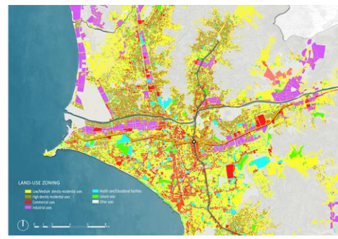
Figures 5-6: Average intensity of public transport per hour; Metro Line 2, and distribution of land uses in Lima Metropolitana.