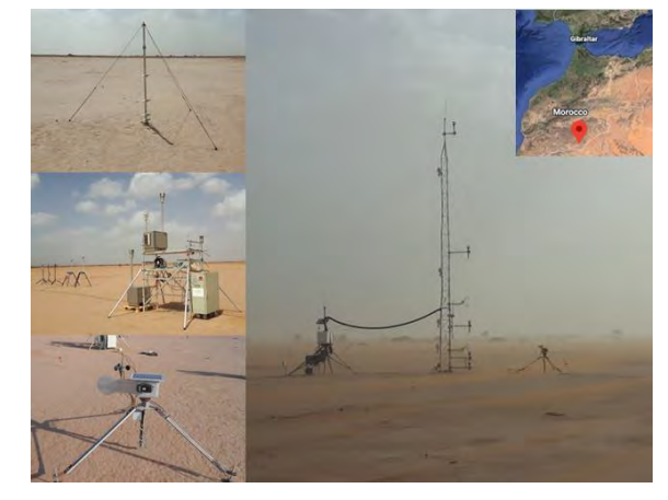
Fig. 1 Photos of the experimental setup at "El Bour" (Morocco) in September 2019 and small insert showing a map with the measurement site.

The first field campaign took place in September 2019 at "El Bour", a dry lake located at the edge of the Sahara, approximately 15 km west of M'Hamid El Ghizlane in Morocco and 30 km north of the Moroccan-Algerian border. Fig. 1 shows some photos of our experimental set up, which includes a wide variety of instruments to perform a detailed characterization of the soil, dust emission and meteorology. These instruments include, e.g., low volume samplers, cascade impactors, passive aeolian sediment traps, saltation sensors, aerosol spectrometers, water content reflectometers, a fully equipped meteorological tower, a radiometer, an aethalometer and a polar nephelometer. Results presented here focus mainly on the time variation of the particle size distribution, in terms of mass concentrations, and its relationship with meteorological variables.