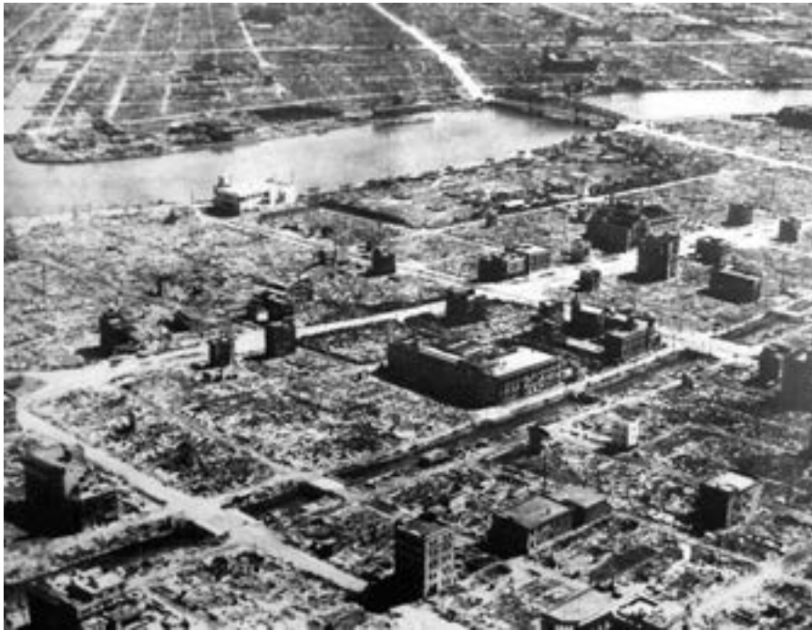
Figure 1. Tokyo, 1945. After USAF incendiary bombing.

political and social backing to implement such schemes, and the initiative for transformation was relinquished to self-construction or powerful interests. Tokyo ended up in both cases being practically rebuilt on its old traces, with no extensive or significant changes. 3