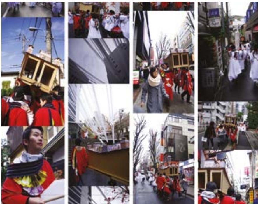
Figure 8. NeoMatsuri_04 - Performance, December 20th, 2014.

– Performing the event in the streets of Kagurazaka, bringing together all the above-mentioned elements in a single architectural action. This included several parades around the neighborhood drawing attention to its urban structure, a representation of the struggle between small and large scale, and a public meal embodying this struggle, to which the local community was invited (fig. 8).