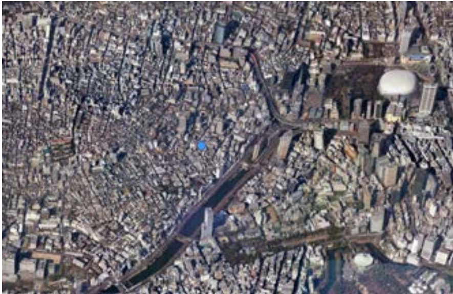
Figure 4. Kagurazaka area in central Tokyo.

The story is as follows: Once upon a time... the Rikadai campus was, in its beginnings, much smaller and fitted neatly into the traditional urban fabric of Kagurazaka, its original setting. But when the institution began to expand, it needed much bigger buildings, including skyscrapers and major developments, and it applied for planning permission. Popular pressure by local residents eventually brought the process to a halt, however, obliging Rikadai to find another campus for its expansion. And in Kagurazaka only medium-size buildings were built, and only on the main road, not in the center of the neighborhood. The newest one, built a few years ago, blends in with the small scale of its surroundings and creates a connecting gate between University and Neighborhood.