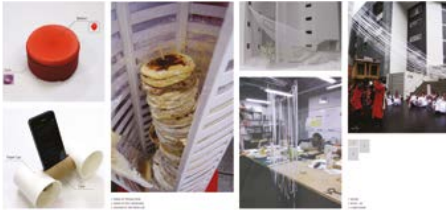
Figure 7. NeoMatsuri_03 - Food, Props and Site Design.

– Performing the event in the streets of Kagurazaka, bringing together all the above-mentioned elements in a single architectural action. This included several parades around the neighborhood drawing attention to its urban structure, a representation of the struggle between small and large scale, and a public meal embodying this struggle, to which the local community was invited (fig. 8).