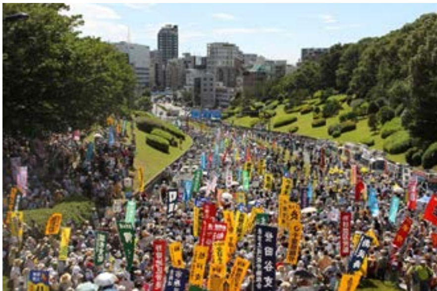
Figure 3. Tokyo, 2011. Fukushima disaster protests.

Now these challenges seem clearer than ever. Social unrest after the Fukushima disaster in 2011 brought thousands of people onto the streets in unprecedented demonstrations urging the government to make changes (fig. 3). True, five years later everything seems to have gone back to normal: even electricity consumption has skyrocketed again, whereas between 2011 and 2012 people were making more rational use of energy; and the last elections in 2014 seemed to give strong support to the ruling president, albeit with caveats. 7