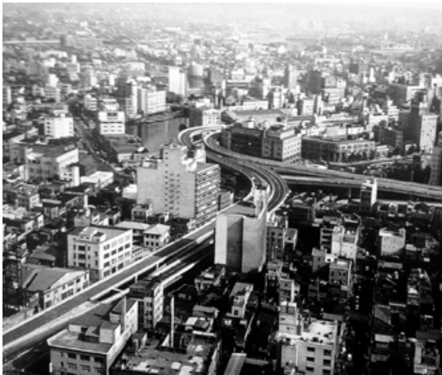
Figure 2. Tokyo 1965. After the Olympic Games.

celed out the previous ones, but coexist in an ever-increasing layered result, where old and new, big and small are intimately intertwined on a truly unique scale and intensity. With no hierarchically defined form, these overlapping processes coexist with the same level of relevance. Infrastructures such as railways (of key importance in Tokyo and elsewhere in Japan), or the highway system built after 1959 and in full operation for the 1964 Olympics, for instance, are laid over the existing urban fabric, neither imposing their logic nor affected by preexisting urban patterns (fig. 2). The result is a sort of awkward, or unformalized, coexistence of mutually accommodating systems.