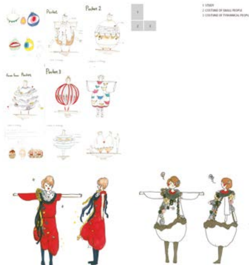
Figure 6. NeoMatsuri_02 - Costume Design.

– Design of the event, its narrative, the parade route, its elements and its conceptual definition as an architectural action. The main purpose of the event was to become a collective tool for urban criticism of current processes of transformation taking place in Tokyo, by which the small scale urban fabric is canceled out and replaced by large scale buildings and privatization of public life (fig. 6);