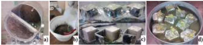
Figure 1 Manufacturing process of geopolymers: a) crushing, b) activation, c) specimens c) curing