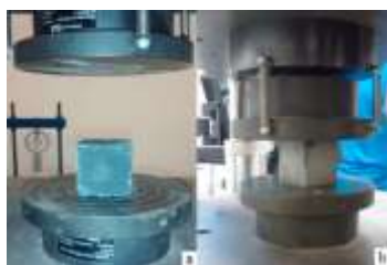
Figure 3 Realization of the compression test: a) before loading, b) specimen tested

Mechanical tests (Figure 3) were performed in accordance with ASTM C109 standard, making an adaptation of this (because there is now a specific for this type of material). These variations were to not use natural fine aggregate and use application speed of the load applied to 50kg/s. The tests were conducted in a universal press mark INSTRON 600DXR2081