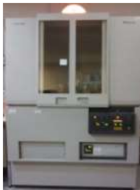
Figure 2 Diffractometer PANalyticalX'Pert PRO

XRD is a technique that was used to detect the amorphous nature and the phases present of the origin FA; as well as to identify the creation of new phases produced by alkaline activation solution. The tests were performed on a diffractometer PRO PANalyticalX'Pert (see Figure 2) equipped with a source CuKa radiation X-rays; the assay was performed in the range 5^\circ to 70^\circ of 2\theta in steps of scanning 0.05s. Samples were prepared by grinding material from the specimens tested in mechanical testing in an agate mortar until obtaining a similar fineness of the talcum, the resultant powders were prepared in the sample holder and introduced into the diffractometer for analysis.