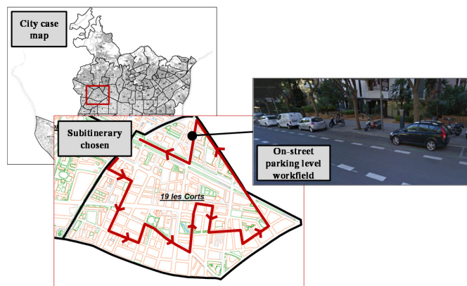
Fig. 1. Example of data obtaining referred to on-street illegal parking level

To record all data obtained, a pattern has been created to write down for each stretch the presence of an illegal parked vehicle with the typology of the violation and, also, some additional characteristics (bus lane, cycle lane, etc.)