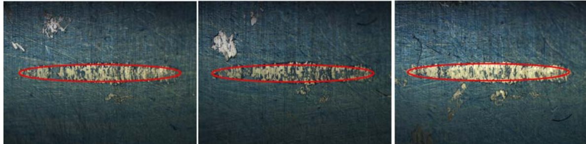
Figure 3 Experimental contact ellipse when F=790,8\text{ N}

790,8 N. In the three photographs it is seen how the marked area it is very similar to the theoretical contact ellipse. Thought the good surface roughness properties there are regions where the cylinder and the roller have not touch. The perturbation done by the surface finish is reduced if the contact force is increased.