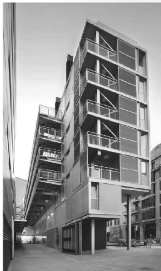
Coll-Lacort - Jaume Coll, Judith Leclerc

The design project recovers a typology little used in the Eixample, the "Mediterranean" block of Antonio Bonet. A hybrid that did not so much seek to break with the rules of Cerdà, but rather to explore the true potential of certain regulations that were never approved, regulations that allowed accidents to be standardised as a habitual rather than an exceptional component of the Eixample. The project thus widened the pavements and distanced the pedestrian from the traffic. Carrer Londres broadens its 20 metres of width, connecting it visually and physically with a park on the inside of the street block, recovering an idea of permeability that is in the origin of the Eixample. Furthermore, the building is fragmented into narrow, parallel structures that are stepped from north to south, allowing the sun to reach both the dwellings and the children's classrooms, avoiding compactness and the air shafts typical of the Eixample, and it manages to achieve the coexistence and dialogue of two different programmes (school and housing).