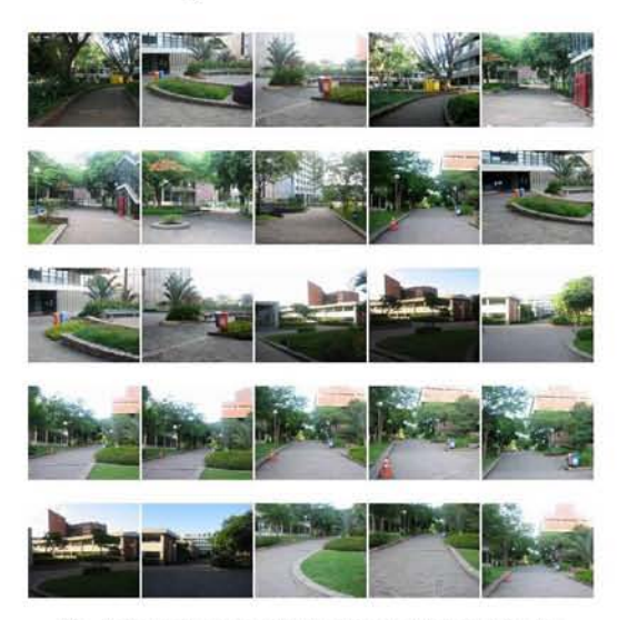
Fig. 2 Some images taken in the outdoor experiment.

To validate the landmark-based view recognition system, a university campus was chosen (PUCRS, Brazil) as a real outdoor environment. A set of 990 view pairs from 45 different views, with 273 landmarks, was analyzed (Fig. 2). An example of weighted bipartite matching for two similar views is shown in Fig. 3.