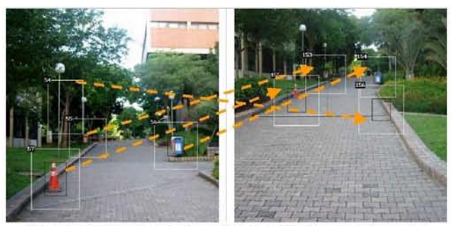
Fig. 3 Landmark matching at similar views. The arrows indicate the solution of the weighted bipartite matching

Using a standard low-performance PC computer (Pentium III 900MHz, 256Mb DRAM, Microsoft Windows XP) the view matching was performed in 0.69 seconds.