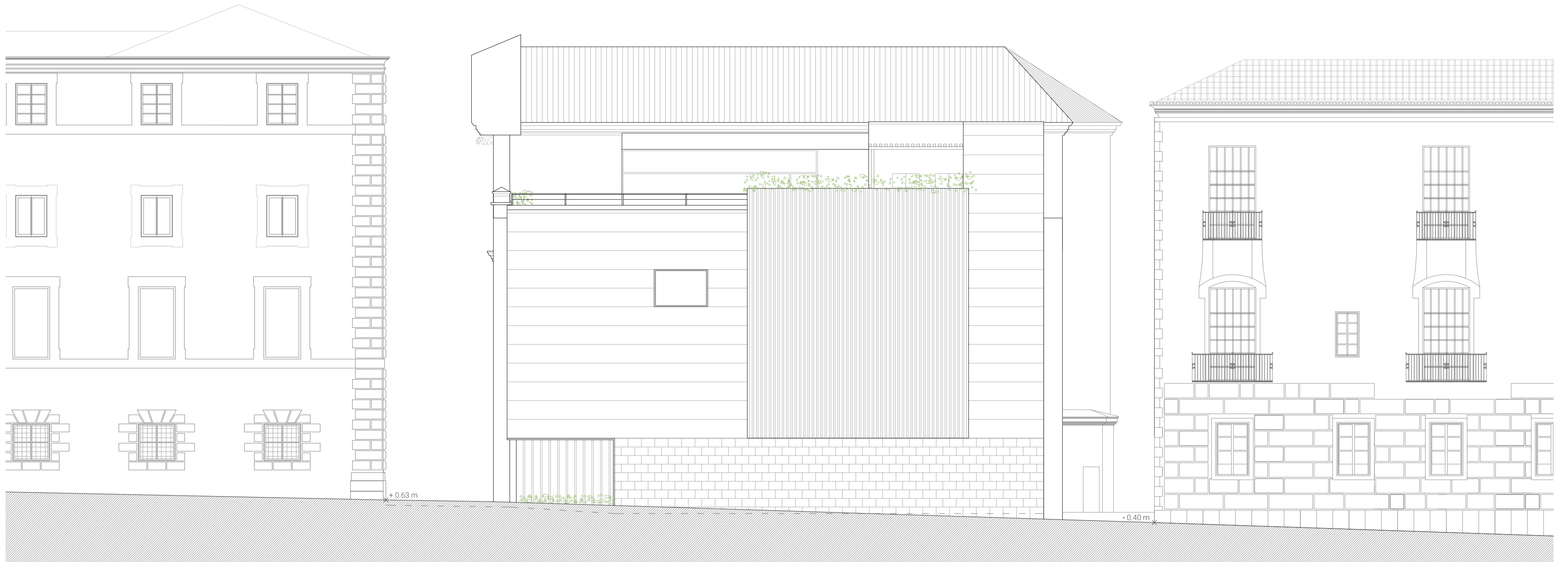
ALÇAT PRINCIPAL PLAÇA GARRIGA I BACHS _E 1:100