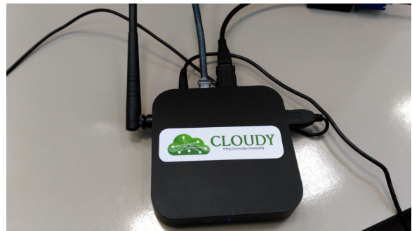
Figure 3: Example of a home server in the edge community cloud.