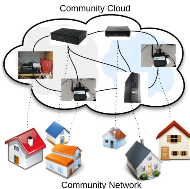
Figure 1: Edge community cloud in Guifi.net, running the Cloudy distribution on heterogeneous hardware.

Figure 1 illustrates the Guifi.net community cloud. Different hardware devices are used as cloud nodes. The Cloudy distribution is installed on each of the devices connected to the community cloud. The cloud nodes are spread over the edge network and in different geographic locations. Desktop PCs are mainly in municipality buildings, most mini-PCs are at user premises.