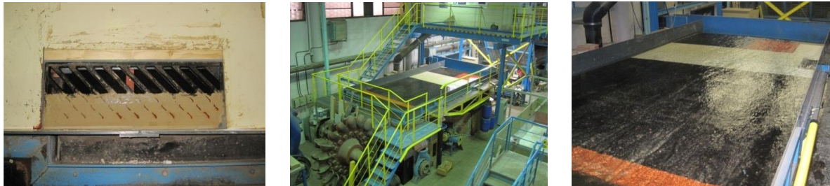
Figure 4. Reproduction of C3 clogging pattern for the Barcelona inlet, and views of the experimental set-up

Tests were developed by covering with gypsum part of the holes of the inlet, reproducing the pattern to be studied, as can be seen in Figure 4 for Barcelona inlet. Experimental data are presented in Figure 5, and from the analysis of these results it is possible to conclude that a potential law is good enough to represent the hydraulic capacity of the clogged inlets. Parameters A and B have varied according to clogged area (Table 4), although quite high correlation coefficients were obtained for the two inlets (i.e. 91.5% for Barcelona inlet (Pattern C3), 77.2% for Teide inlet (Pattern C1), and 75.9% for Teide inlet (Pattern C2)). This confirms the applicability of the verified potential law for clean inlets to clogged inlets too.