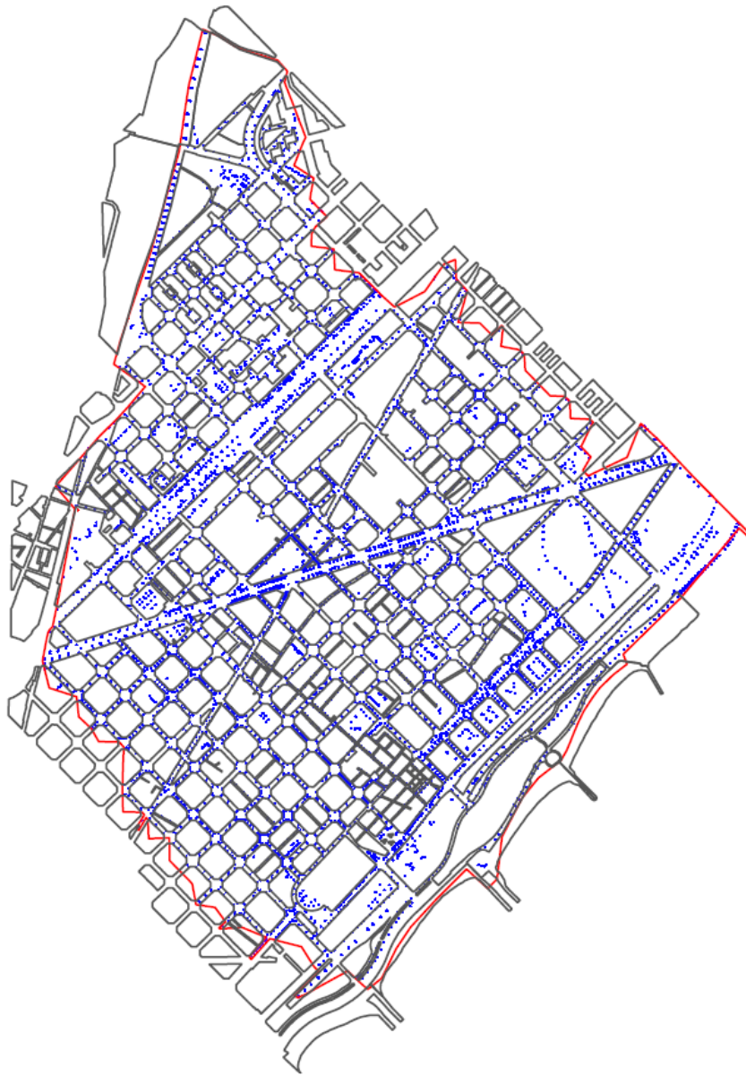
Figure 2. General view of the basin and inlets. Inlets are indicated with dots.