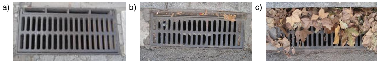
Figure 1. a) Clean and b,c) clogged inlets

pictures of every selected inlet were collected (Figure 1). A comprehensive analysis of the clogged inlets was carried out, by determining several types of clogging patterns, their associated frequency and their spatial distribution. Once the field study was finished, a quantification of the efficiency reduction was determined through laboratory tests, and reduction coefficients of hydraulic efficiency were proposed.