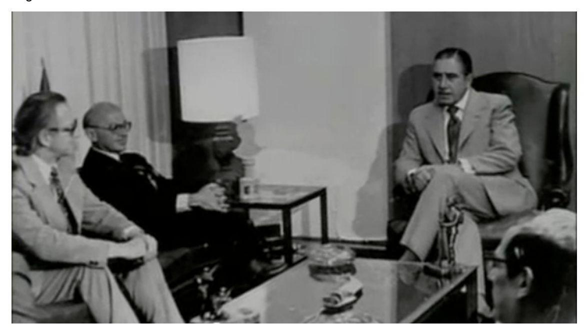
Figure 3: Pinochet meets Milton Friedman.

Pinochet's regime caused the loss of community identity among Chileans, a product of the high repression and severe punishment of any form of community gathering, manifestation or protest. As a proper shock therapy (Klein, 2007), the dictatorship was able to erase the identity and cohesiveness especially among the oppressed: the working and middle classes in Chile.