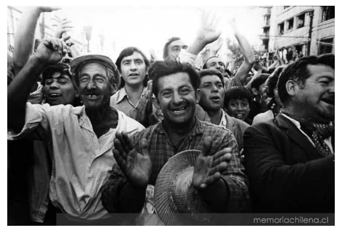
Figure 4: Chilean middle and working class citizens in a political manifestation.

Consumption power —and thus the success of the mall— is limited by personal income, especially among the most vulnerable classes. However, the arrival of the mall in Chile came hand in hand with the credit card, offering broad access to credit with few prerequisites and giving customers the illusion of unlimited purchasing power. Is not by chance that the first credit card in Chile was borne along with mega-retail. Issued in 1982, Fallabella's CMR card intended to give credit to buy in its store, a strategy that was quickly adopted by many other retail stores. According to De Simone and Salcedo (2012), the combination of economic growth, stability and credit access generated the optimal conditions for the rise of the shopping mall in Chile. These same factors, in addition to the above-mentioned changes in labor markets and production structures, explain the development of Chilean clase media emergente .