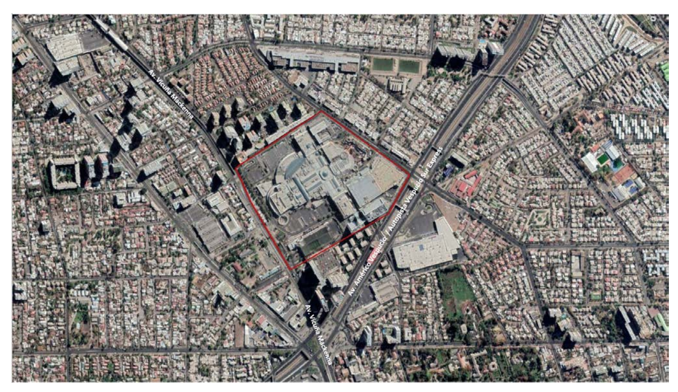
Figure 2: Aerial View of Mall Plaza Vespucio (red contour) and surroundings.