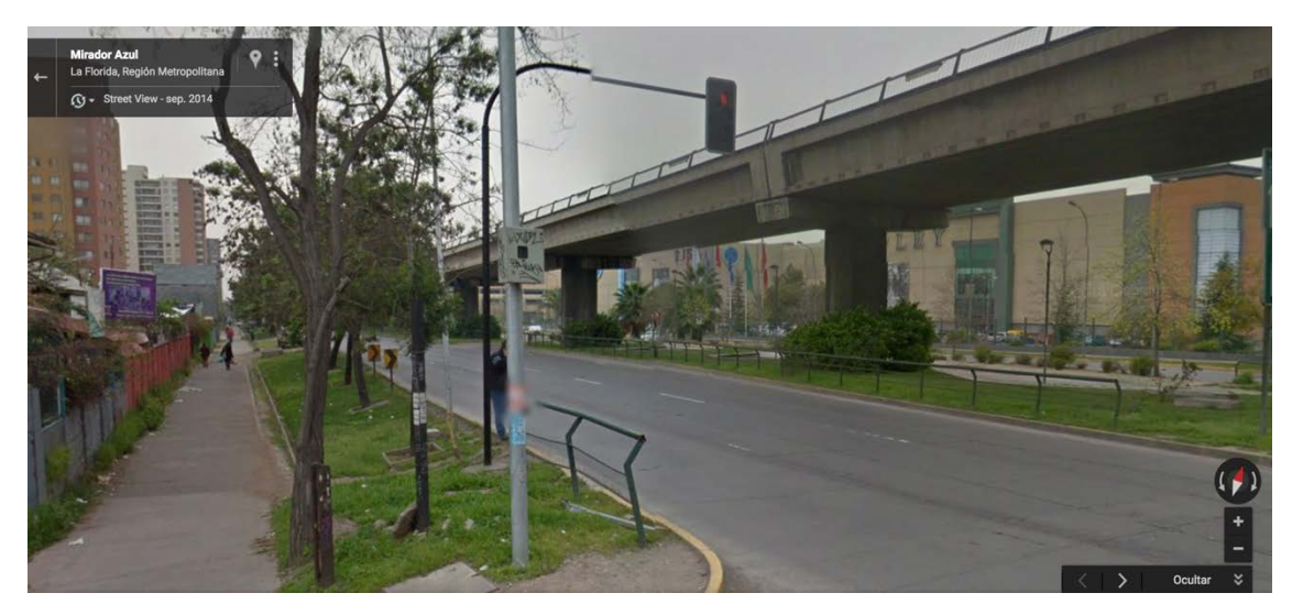
Figure 5: Streets of La Florida outside the mall.