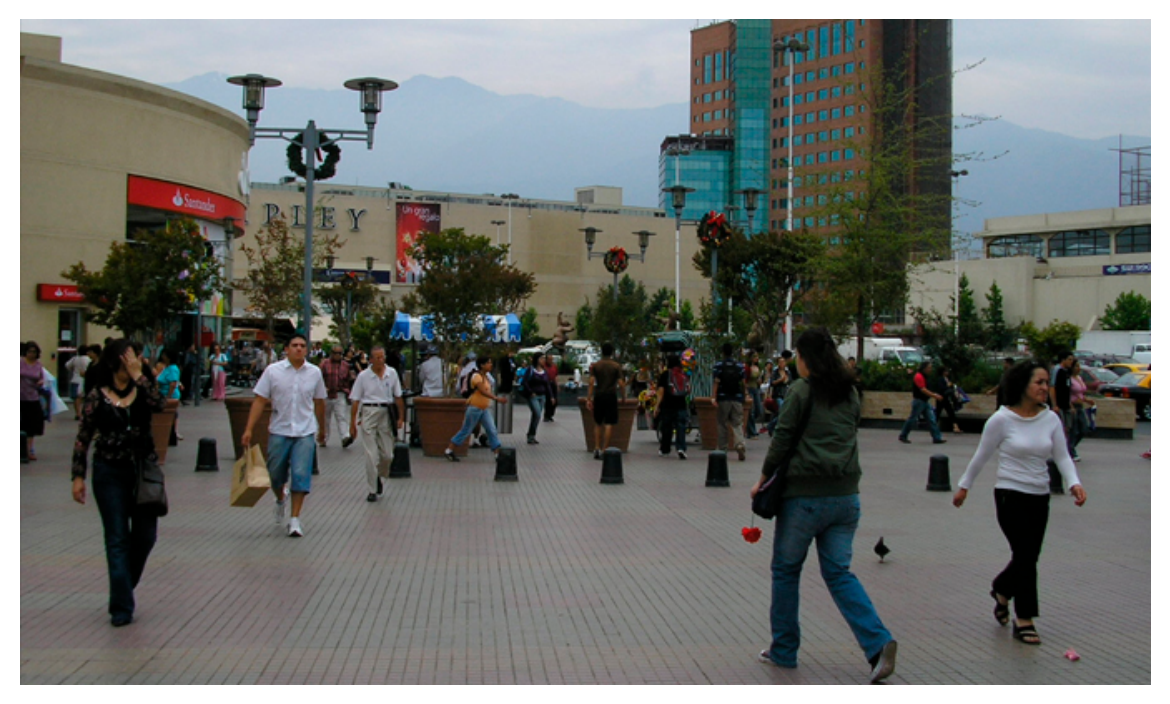
Figure 6: View of the pedestrian access to Mall Plaza Vespucio in La Florida.