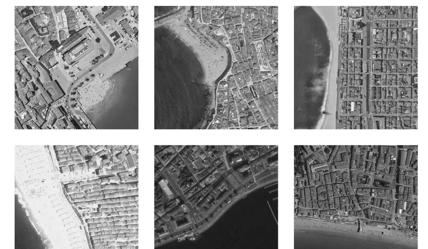
Fig. 01: Cascais, Ericeira, Espinho, Nazaré, Ponta Delgada, Sesimbra. Source: Author edition of Google earth satellite images.

The purpose of the thesis is to define the urban object in its characteristics to be able to operate thereafter, because until now it is treated as a "grey spot." Grey spot in which, at the moment, it is not possible to understand the relationship between urban morphology and the phenomenon of flooding, due to climate changes.