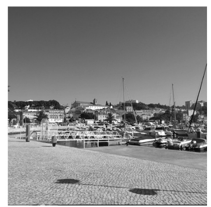
Fig. 02: Moledo, Vila Praia de Âncora, Vila do Conde, Matosinhos, Barreiro, Setúbal.