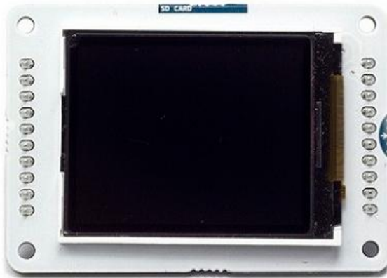
Arduino Graphic TFT Front