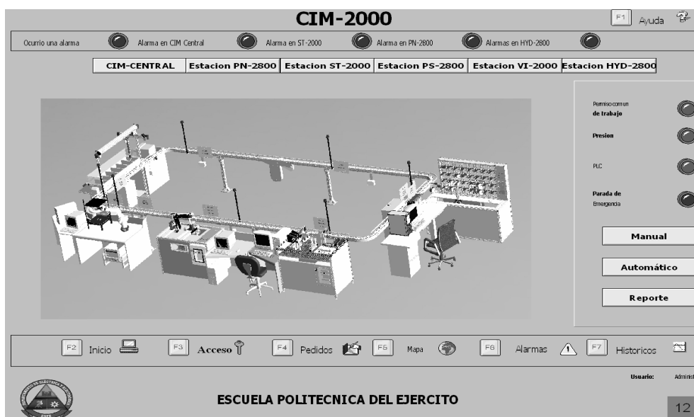
Figure 1. Second HMI CIM 2000 prototype using the GEDIS guideline. In this screen the user has a clear situation awareness (alarm information at the top) and a good access to alarms window or levels of automation (manual control, automatic control)