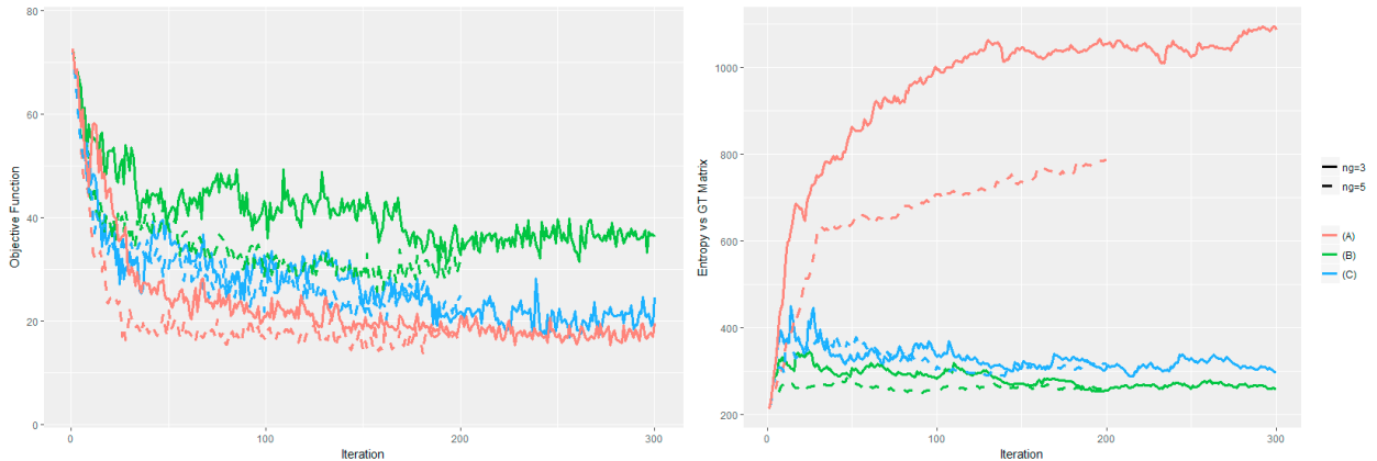
Fig. 2. (a) Objective Function evolution; (b) Evolution of entropy with respect to GT.

Figure 2a shows the evolution of the objective function during the SPSA process for 6 experiments. These experiments have the same initial historical matrix and only the method and number of averaging gradients change. Note that for the three methods (A), (B) and (C) that are defined in Equations (3), (6) and (7), respectively, the experiments with n_g = 5 present a better initial descent and fewer oscillations. On the other hand, the basic SPSA problem (A) is the one that obtains a lower value, while Problems (B) and (C), which are restricted and penalized problems, converge on solutions with higher objective function values. Figure 2b shows the same experiments, but by plotting the entropy with respect to the Ground Truth OD matrix. The order of the methods is completely opposite: the best performance, in terms of similarity is the restricted SPSA; while the worst is the unrestricted SPSA, (A), whose entropy value clearly increases. Balancing the two plots of Figure 2, Penalized SPSA (C) achieves a higher quality solution while also delivering a good performance of the objective function minimization procedure.