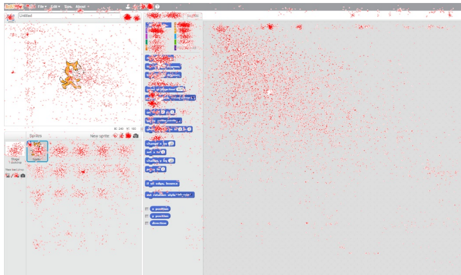
Fig. 2. Zones of Scratch user interface students have clicked on.

To comprehend where the students interacted in Scratch we created an image with the Scratch interface and the map of clicks.