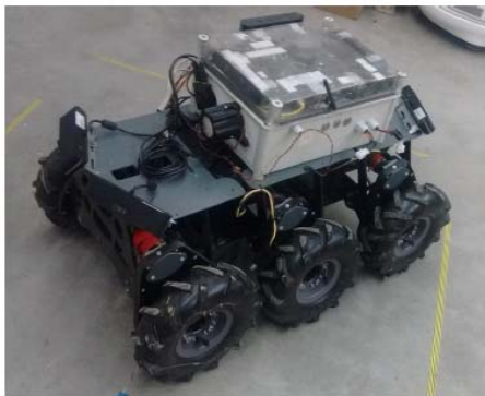
Fig. 2. SIAR prototype of Phase 1

These features made the process of sewer inspection a risky and expensive process that requires improvements urgently. Sewer inspection is a service included in the public management of the sewers of Barcelona. Nowadays, sewer inspections are done by people performing visual inspections and collecting information about the state of the sewage like sediment level and type, pipe obstructions, etc. Because of the sewer risks, the performance of the inspections is about 1.5km of sewer every 6 hours. This methodology requires approximately 1 million Euros per year in staffing expenses only, excluding equipment, machinery, health and safety measures, or other expenses. There is no regulation that applies to this public service except for the prevention of occupational hazards and, in particular, the regulation of access to confined spaces. The city is willing to amend the legislation of its jurisdiction for introducing this new technology. Barcelona sewage system network has a wide variety of sewers. This enables us to test the technology in various sewer sizes and facilitates the transfer of the technology to other cities.