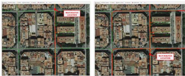
Fig. 6. left, Wi-Fi propagation (in red) in Barcelona sewer tunnels (in green); right, improved Wi-Fi coverage (in red) after taking sewer network topology (in green) into account.