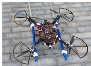
Fig. 4. ARSI platform setup.

The proposal is the use of a Micro Aerial Vehicle (MAV) (see Fig. 4) for inspection tasks in the sewer avoids the mobility constraints from which a ground robot would suffer, such as paths with steps, steep drops and even objects in the way. Additionally, a flying platform is able to move faster through the sewer network than the terrestrial alternative and needs simpler logistics in deployment and operation (see Fig. 5). On the other hand, a MAV solution has to overcome strong constraints of size, weight and energy, as its flying space is bounded by sections less than 100 cm wide. Therefore, its size and consequently payload are limited to minimal dimensions.