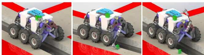
Fig. 3. SIAR Robot deploying one wifi communication repeater.

The deployment of repeaters whenever the Line-of-Sight (LoS) is expected to be lost, and therefore the quality of the links could begin to degrade, is proposed. This will extend the operational range of the robot in more than 300 m. for each repeater.