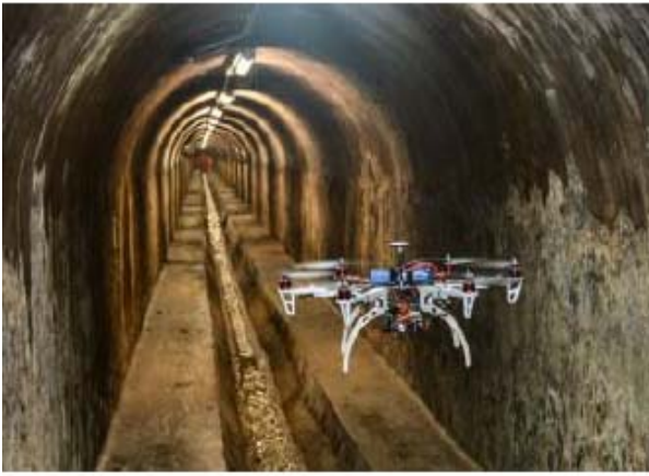
Fig. 5. Quadrator flight in a real sewer in the city of Barcelona.

The ARSI consortium has addressed the problem of sewer inspection with the integral design of an aerial platform, multi-rotor type, endowed with sensors for semi-autonomous navigation and data collection within network, and capable of communicating with an on-surface operator. The different drones that will be operating inside the sewer will be monitored and controlled from a van parked outside, in the street, and the workers will assist the robots to replace the batteries. Initially, it is expected that drones can work in tunnels with a minimum width and height of 80cm. Nowadays, a human worker can operate inside a sewer of a minimum width of 60cm and 1m high, under these dimensions only robots can operate. That means that human workers can only work in 843km of sewer, a 55% of the sewer network in Barcelona; the remainder of the sewer is covered with teleoperated cable robots, and the inspection of 1.5km takes 6 hours in average [6].