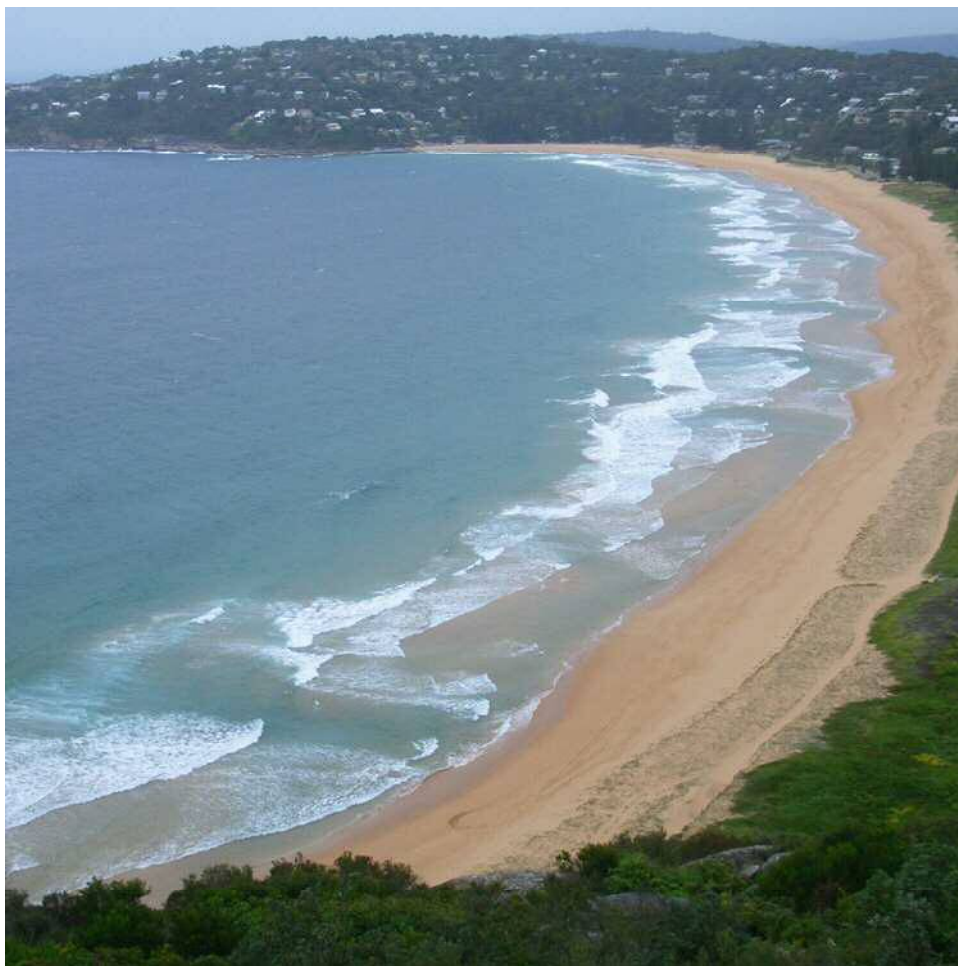
Fig. 13.2 Transverse bars at Palm beach, Australia, corresponding to type 1 (TBR bars), with spacing between bars of a few hundred metres.

distance are often observed (Fig. 13.2). In the presence of an alongshore current, they migrate downdrift with migration rates of up to 40 m/d (Hunter et al. 1979; Konicki and Holman 2000; Ribas and Kroon 2007; Pellón et al. 2014). Four different types of transverse bars have recently been characterized (Pellón et al. 2014; Ribas et al. 2015).