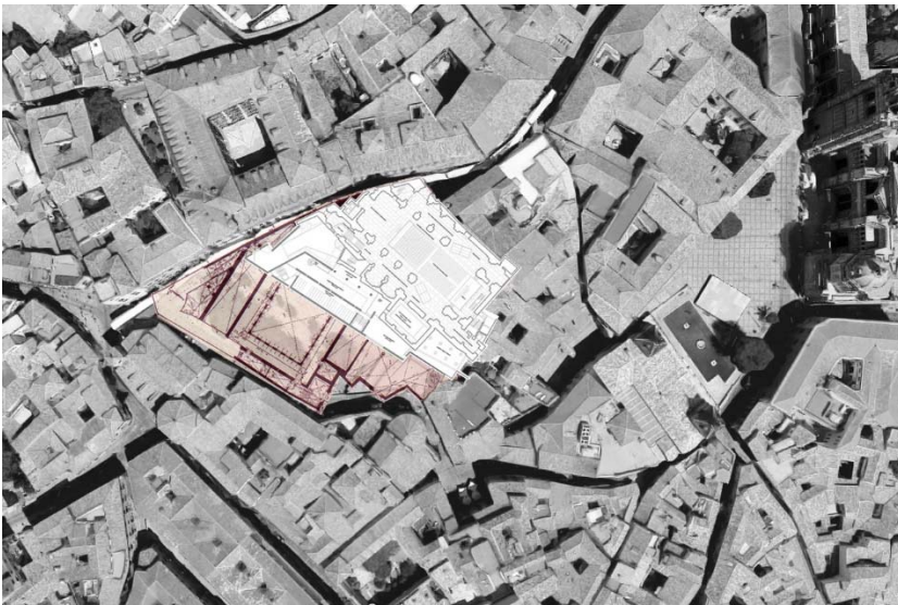
Fig. 4 - Ignacio Mendaro Corsini, Centro Cultural Templo de San Marcos y Archivo Municipal, Toledo, 2000. Superposition of the current plan on the old plan of the cloister, over the Toledo orthophoto. Editing by the author.