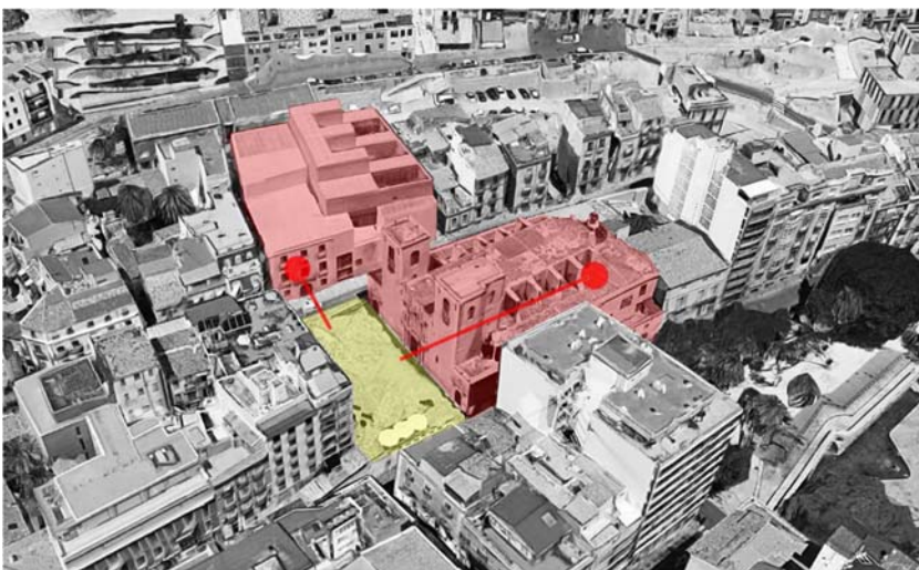
Fig. 3 - J. C. Sancho y Sol Madrideojos S-M.A.O., MACA Museo de Arte Contemporáneo de Alicante, Alicante, 2010. Axis and urban nodes. Drawing by the author.