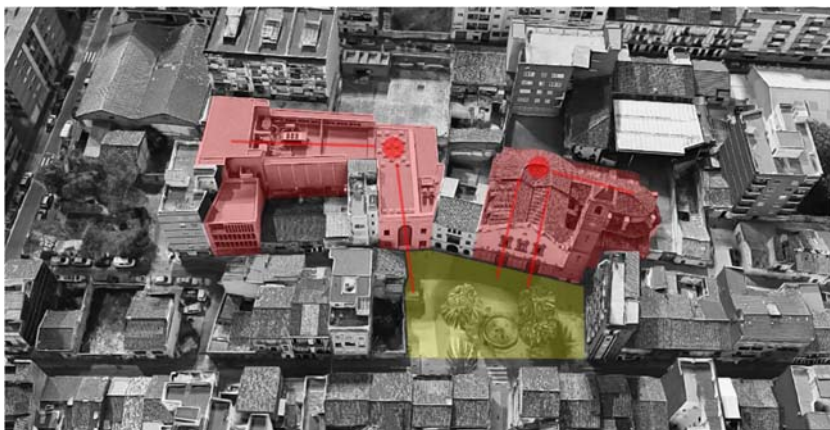
Fig. 1 - Eduardo de Miguel Arbonés, El Musical Cultural Center, Valencia, 2004. Axis and urban nodes. Drawing by the author.

The building engages on the façade of a pre-existing building that was restored, removing all internal old walls, maintaining the orthogonal entrance axis that rotates in correspondence with the entrance hall. The technical spaces and the offices are placed in a small volume that occupies the width of a lot, reconstructing the urban prospect on the relative path. The construction results therefore, in a certain limit, 'plastically' inserted into the pre-existing building fabric: it retrieves, even partially, the masonry construction on which the new building is engraved and enters the context, adhering physically to it, reaching a new balance, both social and material: to the special polar religious function, represented by the church building, it was added the special one related to theatrical and musical activities, represented by the new special building. This fact contributes to increase the urban polar role of the square. In addition, the building is designed and made by reinforced concrete: but there are no pillars or beams structures, and this indicates a particular constructive character of the building that is plasticity. And plasticity tends towards organicity that unites construction and space into a single architectural act: load-bearing walls become overwhelmed and emptied, enabling services and vertical paths to be embedded in the interior of walls, while simultaneously enabling the lighting of the room.