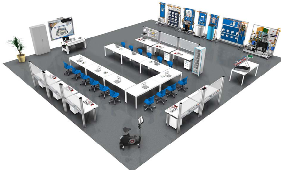
Fig. 1. Distribution of the renewable energy laboratory.

levels), in finalist courses of the degree it is important to reach these last Bloom's taxonomy levels, in order to carry out the idea of "globalization" for bachelor's degree students.