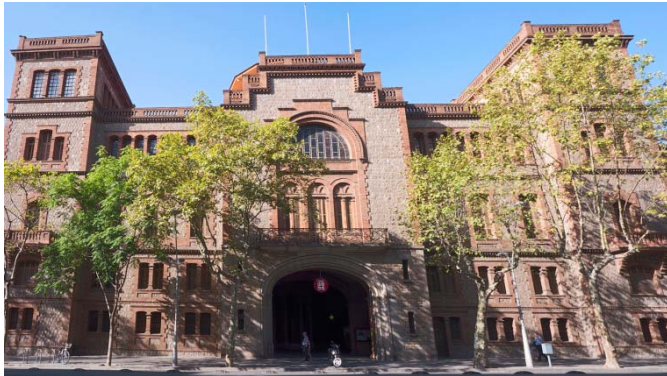
Fig. 2. The old Barcelona College of Industrial Engineering (Escola Universitària d'Enginyeria Tècnica Industrial de Barcelona, EUETIB) of the UPC.

The Barcelona College of Industrial Engineering (EUETIB), Fig. 2, which, with over 110 years of history, has been (since 1904) forming industrial experts, industrial engineers and engineering graduates over decades, focusing on four classic specialties of the industrial sector: Industrial Chemical Engineering, Mechanical Engineering, Industrial Electrical Engineering, and Industrial Electronics Engineering [5].