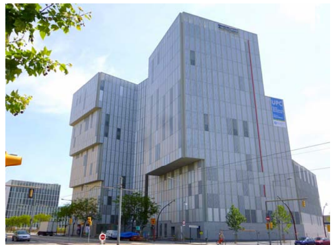
Fig. 1. The new Eastern Barcelona School of Engineering (Escola d'Enginyeria de Barcelona Est, EEBE) of the UPC.

Since September 2016, the Technical University of Catalonia ( Universitat Politècnica de Catalunya , UPC) – BarcelonaTech has a new Campus in Barcelona city, Spain, the Diagonal-Besòs Campus. In this new Campus appears the Eastern Barcelona School of Engineering ( Escola d'Enginyeria de Barcelona Est , EEBE), Fig. 1, with new Bachelor's and Master's Degrees [4]. This new school derives from the old Barcelona College of Industrial Engineering ( Escola Universitària d'Enginyeria Tècnica Industrial de Barcelona , EUETIB), which was a higher education institution associated to the UPC [5].