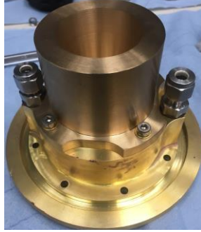
Fig. 3 de Laval nozzle

The current test facility for IPG6-S was previously used for RIT testing. The vacuum tank has a diameter of 2 m and a length of ~5 m, see Fig. 3. The main vacuum facility provides background pressure of ~ 1 Pa, while a system of oil diffusion pumps can bring the background pressure down to 1E-5 Pa. A recent