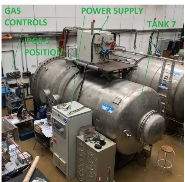
Fig. 3 IPG6-S refurbished facility

refurbishment has been completed and preliminary tests will be performed by the first middle of September 2017. Test will include calorimeter measurements of the plasma plume energy leaving IPG6-S with various nozzle configuration.