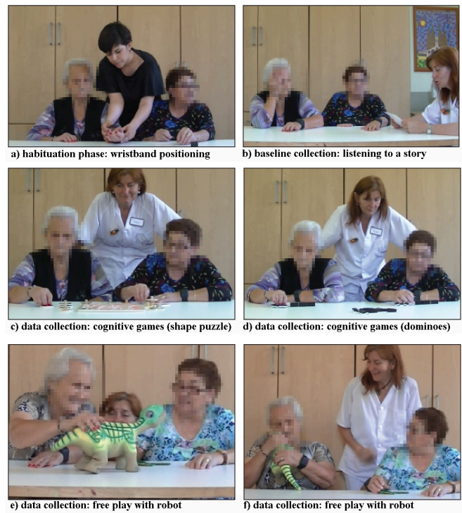
Figure 4. Excerpts of data collection

once participants reached the room, cameras were switched on; 2) habituation phase : the experimenter conversed shortly with participants, while they sat to recover from the effort of walking to reach the room, afterwards the experimenter helped participants to wear the sensor (Figure 4a); 3) synchronization : the experimenter switched on the wristbands, and pushed the tag buttons on top of the watches simultaneously in front of the switched on cameras; 4) baseline collection : the facilitator read a fairytale (5 minutes) to participants (Figure 4b); 5) data collection : the participants played the three cognitive games (20-25 minutes, Figure 4c and 4d) or interacted with Pleo (20-25 minutes, Figure 4e and 4f); 6) end of activity : the experimenter switched off the wristbands in front of the cameras, removed them, and switched off the cameras. At this point, participants were guided back to their units, and, when facilitators headed back to the activity room, they filled out the OME and OERS.