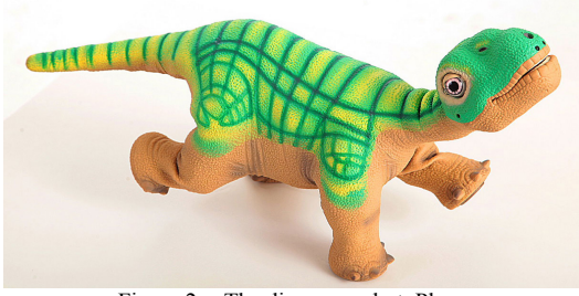
Figure 2. The dinosaur robot, Pleo

equipped with touch sensors, microphones, ground foot sensors, force-feedback sensors, orientation tilt sensors, infrared mouth sensors, a camera-based vision system, and a beat detection system.