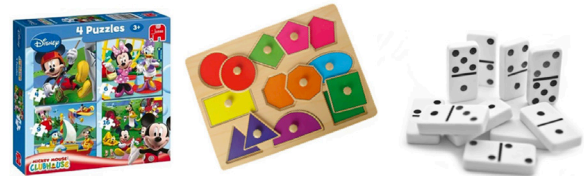
Figure 1. Cognitive Games

Cognitive games were jigsaw puzzles, shape puzzles, and dominoes (Figure 1). The order of presentation of the cognitive games was randomized using a Latin squares technique, thus it was always different in the three sessions.