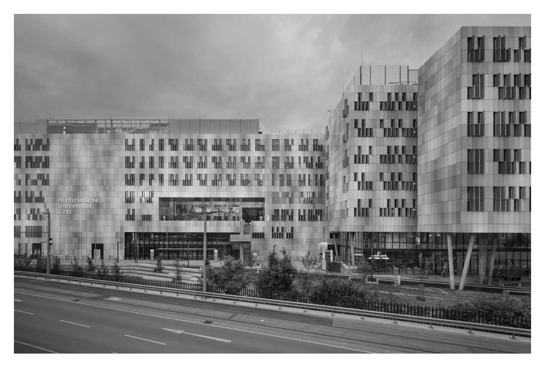
∧ MED campus Graz.

Reservados todos los derechos. Ninguna forma de reproducción, distribución, comunicación pública o transformación de esta obra se puede hacer sin autorización expresa de los titulares.