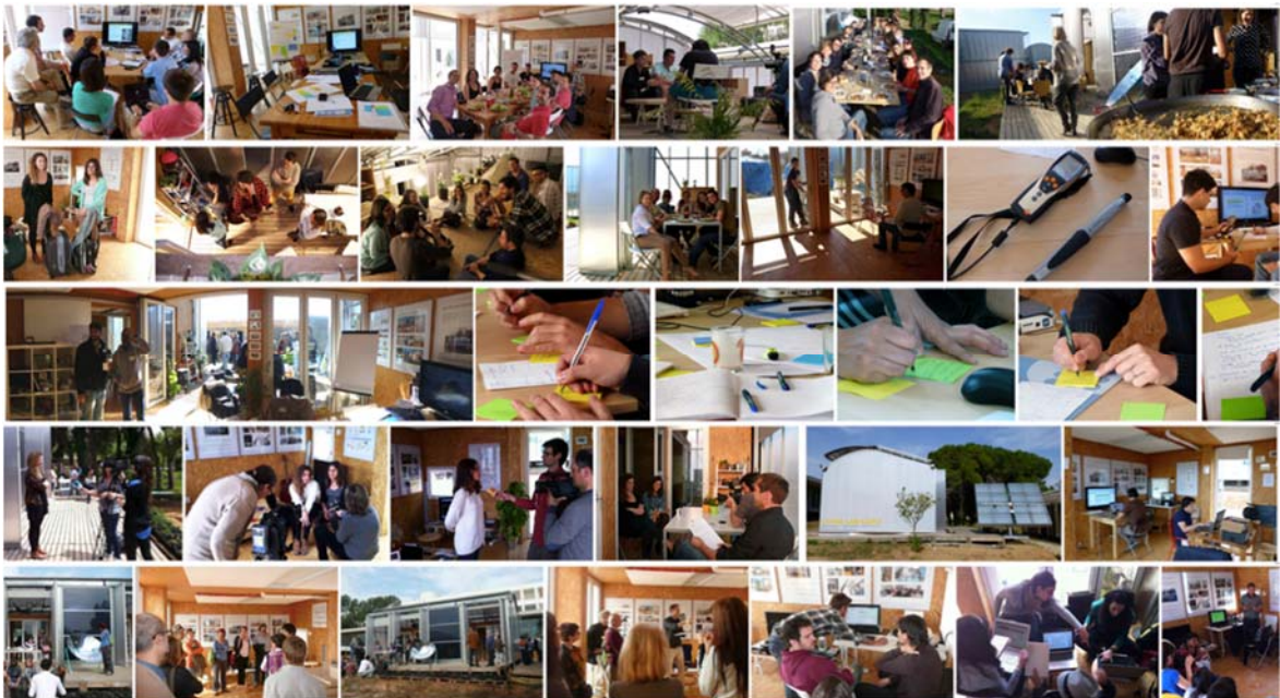
Fig. 2: Diversity of uses of Living Lab LOW3 for research, teaching and university outreach

Figure 2 shows the diversity of uses of Living Lab LOW3 for research, teaching and outreach.