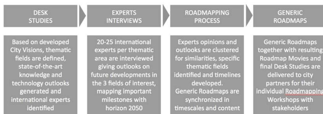
Fig. 4: Process of generation of Generic Roadmaps

Figure 4 shows the 4 steps, which led to the generation of Generic Roadmaps.