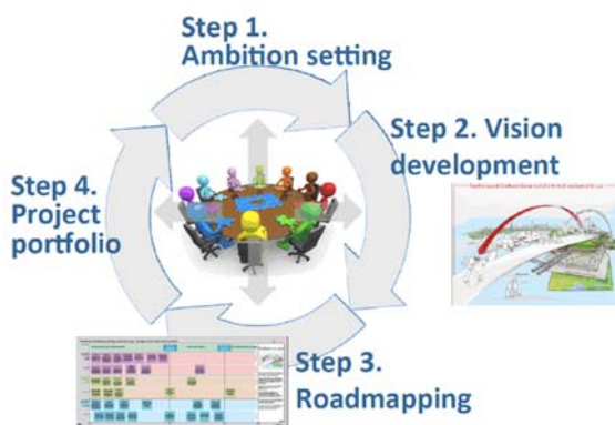
Fig. 1: 4-step R4E process

The R4E partner cities run through a 4-step R4E process (Figure 1), starting with the Ambition setting (step 1), and a Vision development and scenario building process (step 2) in order to discuss, define and describe a common desired future for their city with the participation of all type of local stakeholders such as citizens as well as relevant research and industry partners. In a third step partners develop Energy Roadmaps as the result of a cooperative process engaging, as in all previous steps, key stakeholders within the region from the business and knowledge sectors.