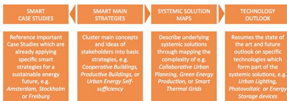
Fig. 2: R4E Desk study structure

These desk studies include the following 4-step approach in order to structure knowledge and give consistent future outlooks on technologies related to smart energy strategies of cities (Figure 2).