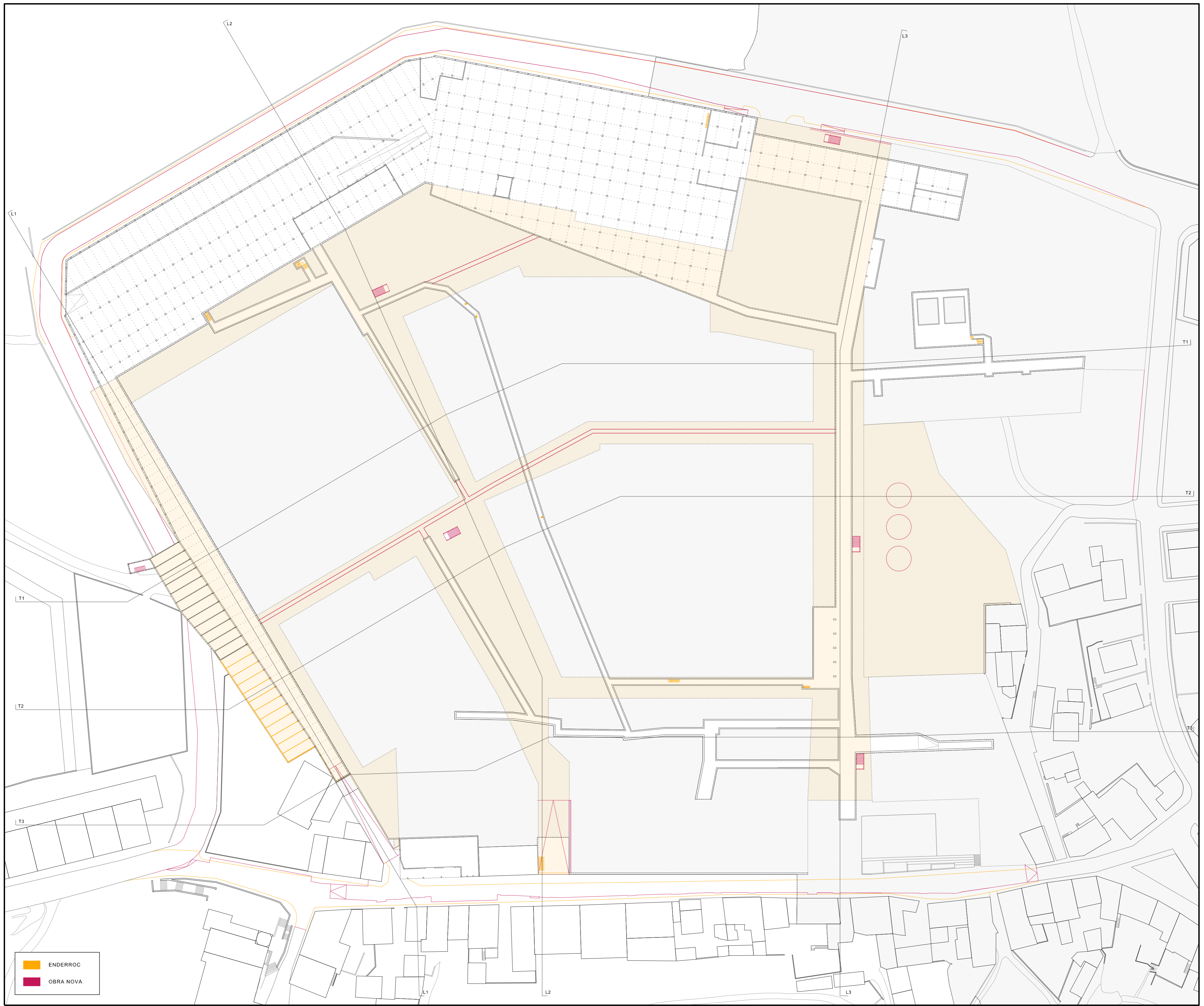
PLANTA -1: ENDERROC / OBRA NOVA 1:800