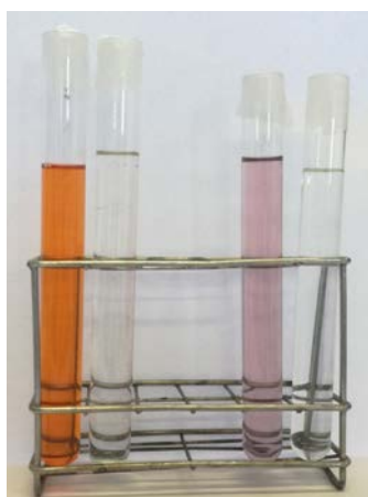
Figure 5. Effluents before and after the ECUVal system

Currently, the validation of the pilot at industrial scale is being carried out. The first tests have shown that the ECUVal system enables to discolour the mill effluents (Figure 5) and these decoloured effluents that can be reused in new dyeing processes, with both monochromies and trichromies. The viability of the ECUVal system and the potential consumers has been evaluated by means of a business plan study.