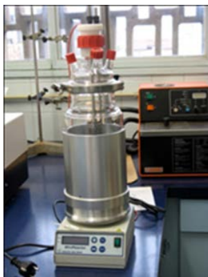
Figure 2. Electrochemical cell used at lab scale

Effluents from the Jet dyeing process were selected for this study. First of all, the effluents were treated at laboratory scale in a 0.5L electrochemical cell with a single compartment. In all cases, the intensity was set at 10A. The electrodes used had an active surface of 45 cm 2 (Figure 2).