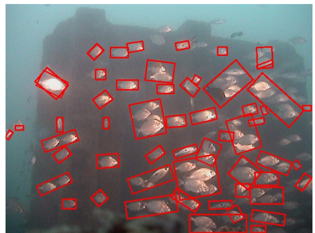
Fig 2. An example of an image where the learnt classifier identifies groups of fishes as just one fish.

If the scene is crowded the classifier identifies group of fishes as they were just one fish (Figure 2). That is why in the time series corresponding to crowded periods, the number of recognized fishes is smaller than the number of observed fishes (Figure 3). Nevertheless the trend of the fishes is still coherent.