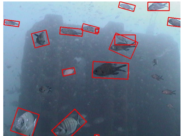
Fig 1: An example of image captured and automatically recognized with the camera without fouling

as fishes (false positives), while if the camera is clean some false positives occur, without affecting the performance. Generally the classifier was effective in fish identification in moderated fouling conditions (Figure 1).