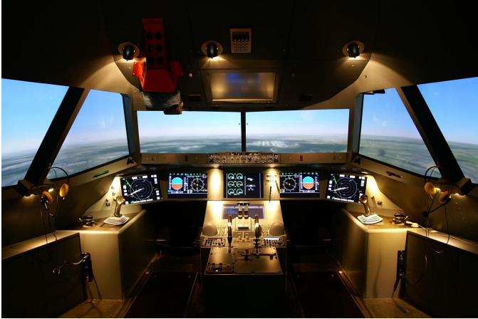
Fig. 2. GECO cockpit layout

Finally, the subject pilot was seated in the right side of the cockpit and the experimental EFB was located in the right side of the pilot position, approximately in line with his/her shoulder.