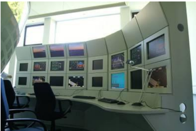
Fig. 3. GECO simulation control position