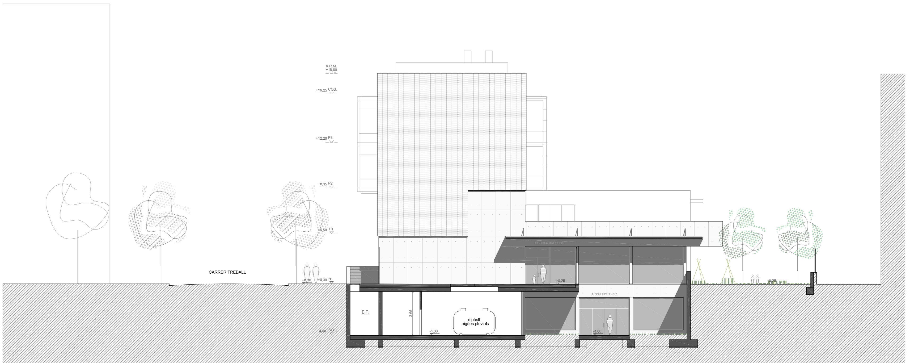
ALÇAT LATERAL E: 1/150