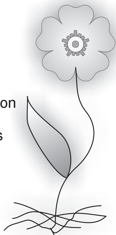
Creation of the university complex

The consumers of educational services are becoming the full university partners and keystones of net structures, setting the modernization of educational practices and development of R&D at educational institutions. Sustainability of educational system as a whole and of individual universities is determined by scale and depth of integration, extent of contacts between producers and consumers of educational services.