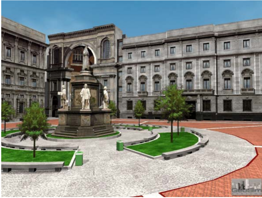
Fig. 3: Virtual Milan (Piazza La Scala)