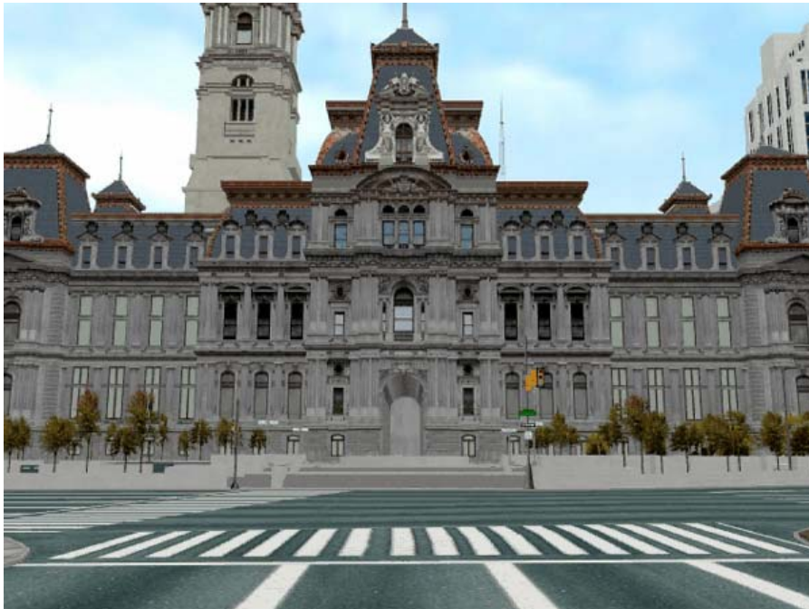
Fig. 4: Virtual Philadelphia (City Hall)