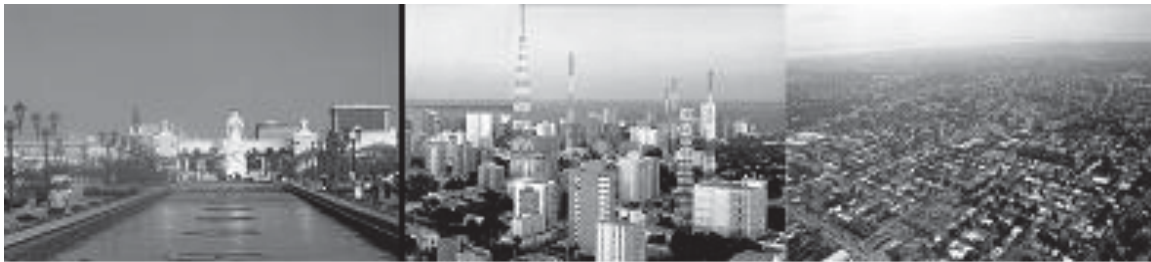
Figure 1. VMG Hybrid City Urban Praxis: “Paseo la Chinita,” “La Lago” and Urban Sprawl

The VMG builds the hybrid city to improve the quality of life for its citizens and, through this process, is legitimized by performance, creates confidence, social capital and empowers citizens, strengthening local governance. The desirable VMG formula is: Government by Policies (G/P) + Good Government [legitimacy by performance, efficient response to citizen needs] = Governance. To “govern by policies” (G/P) implies responding to citizens’ interests and recognizing the plurality and competitive character of citizen demands [3]. VMG is essentially a form of government-driven by policies that entails a particular governance landscape (Figure 1) [4].