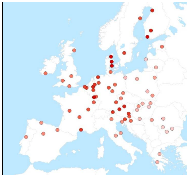
Figure 5. City sample and group rating The darker the colour the better the rating

Through this transformation indicators are now comparable and appropriate for any aggregation procedure. Assuming the substitution between indicators all (not missing) values are added up to the aggregated value for every factor resp. for every characteristic and in total for every city itself. As there are missing data which does not allow calculating the (standardized) indicator value, we finally do not use the sum of all values but the average value of the aggregated values divided through the case-specific number of values.