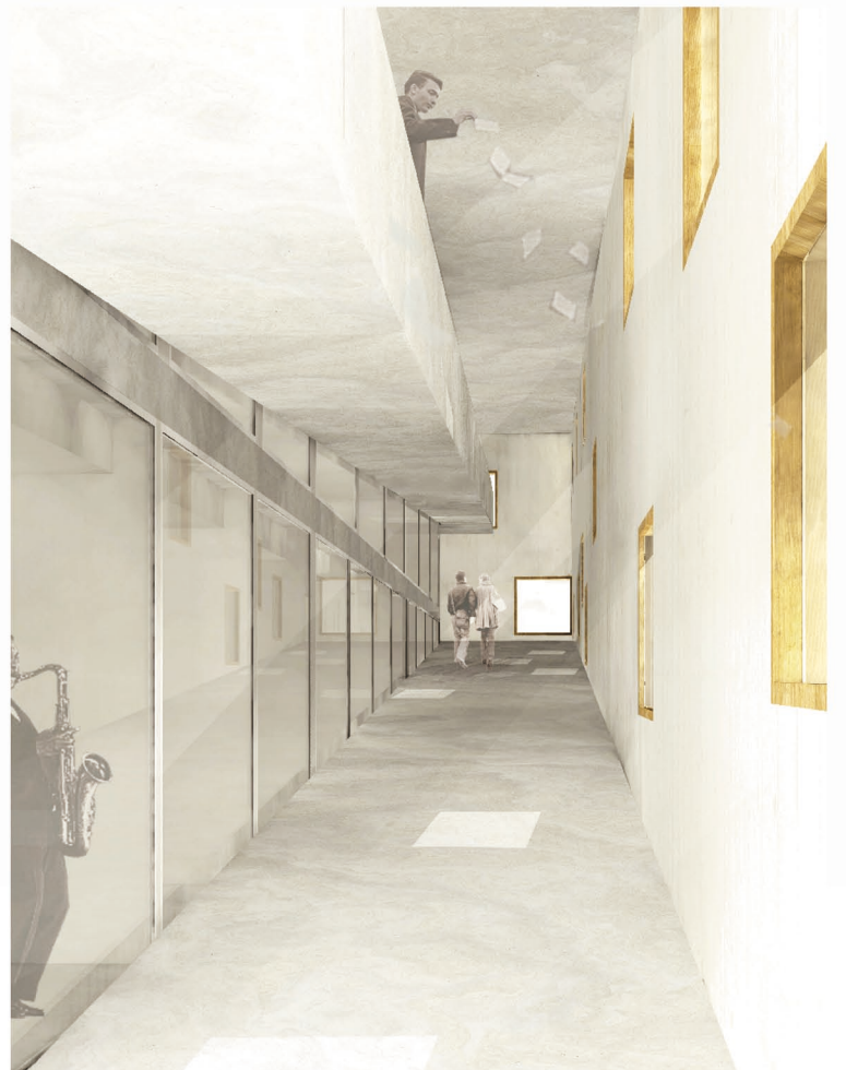
1:40 E 1/40