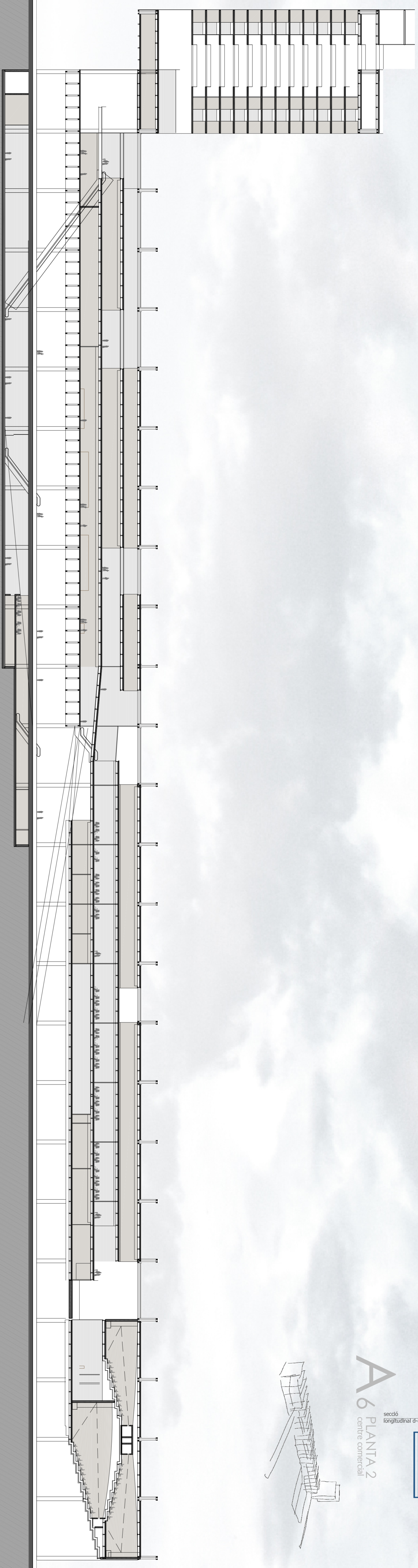
secció longitudinal d-d'