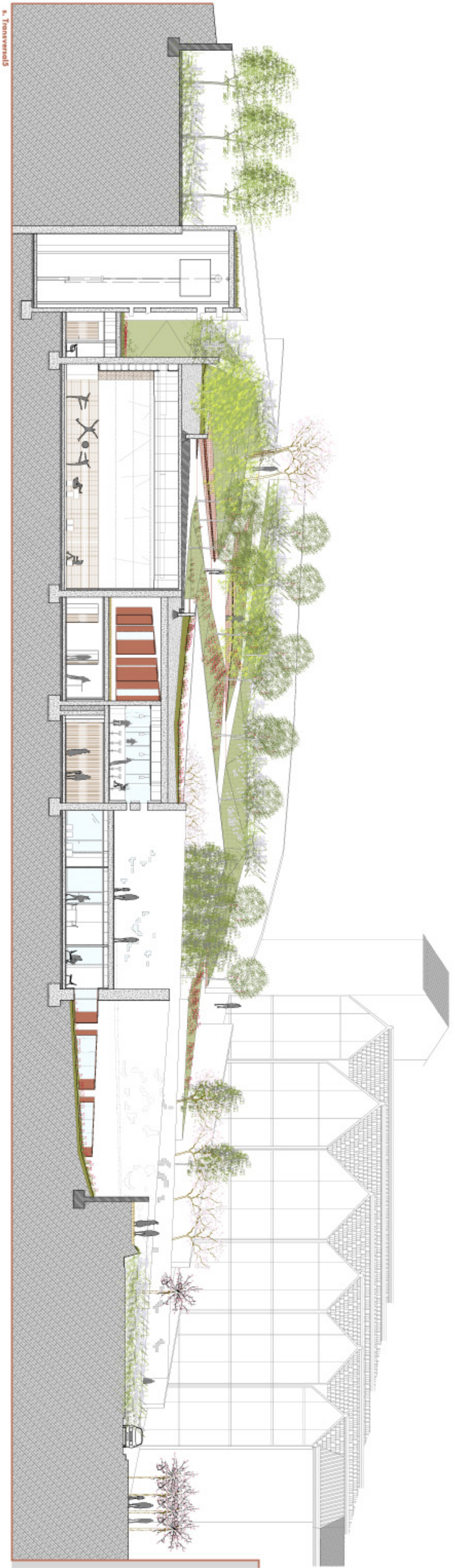
a. Transversal 5