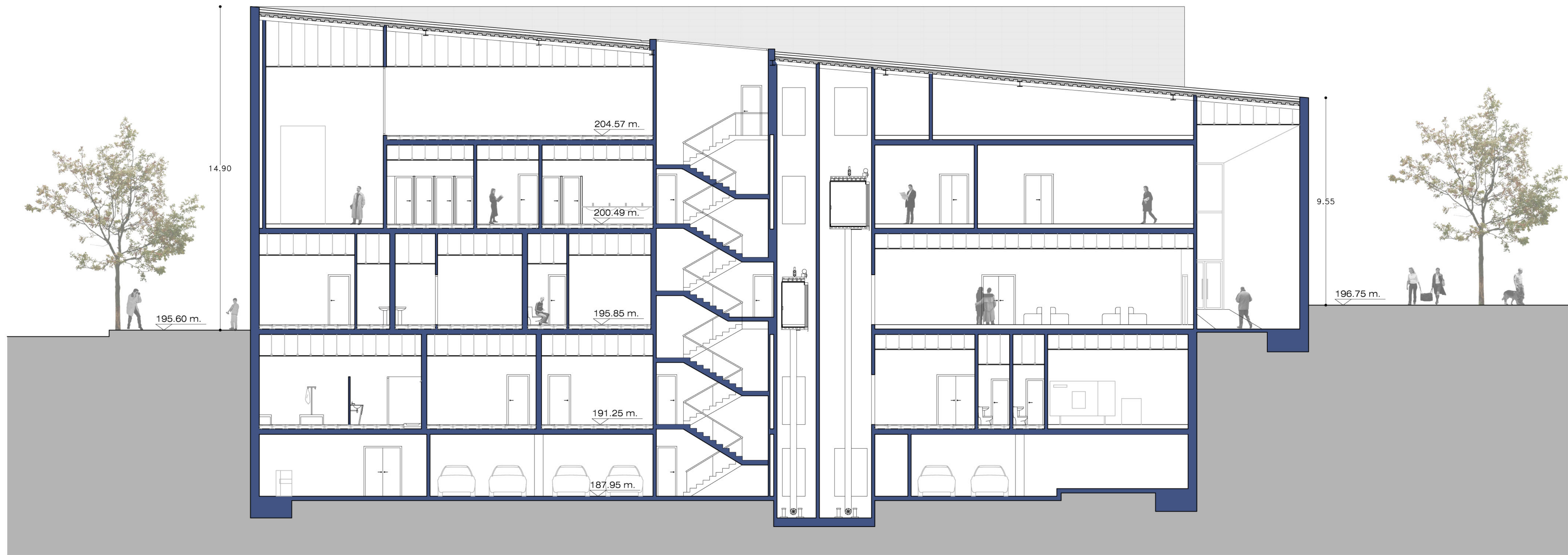
SECCION E - E'