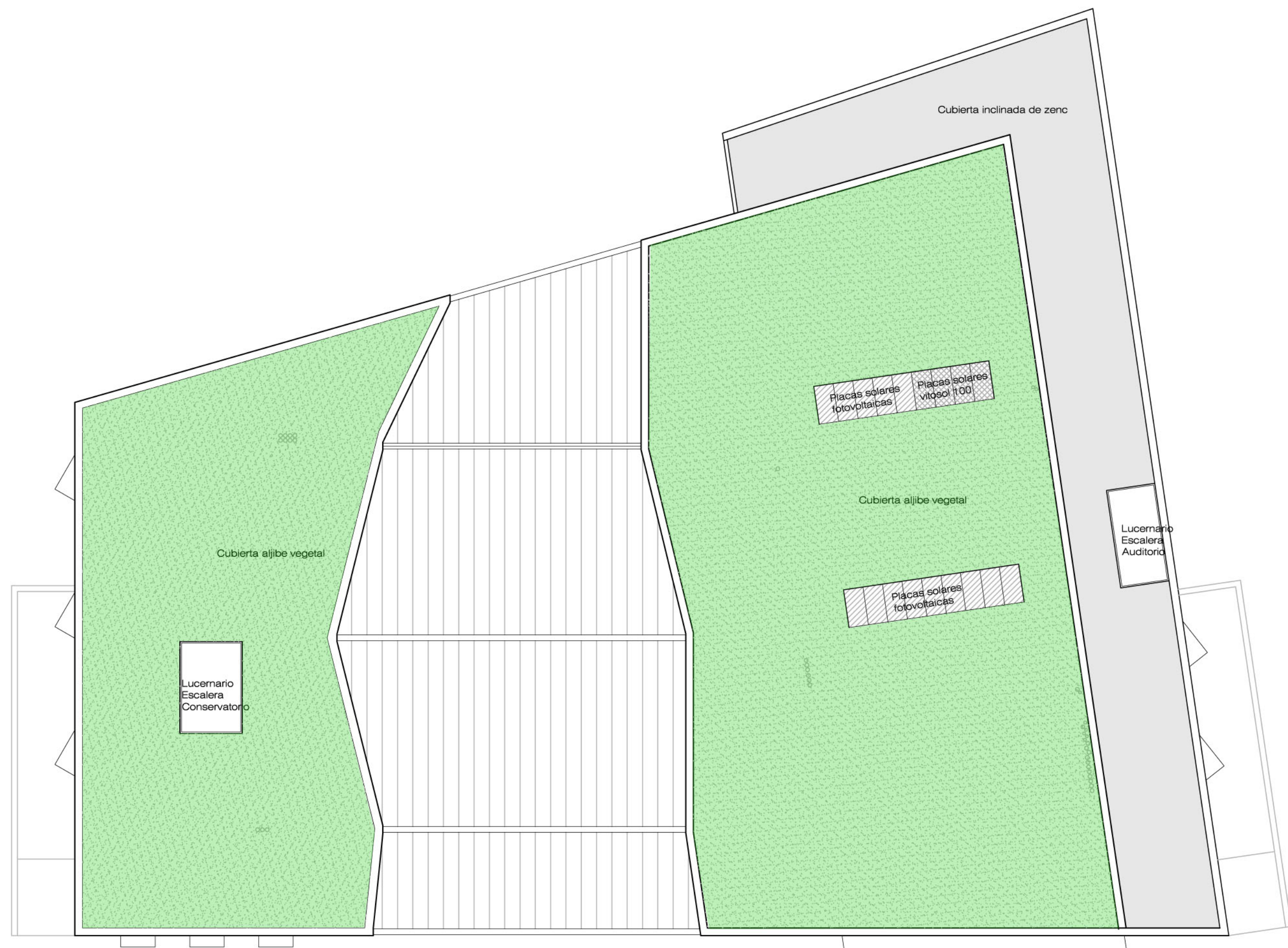
PLANTA CUBIERTA E 1:200